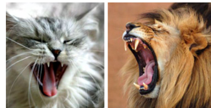
Little cat or big cat, these are the teeth and jaws of a predator.

Take a good look at your cat's mouth. Just as in a big cat, these are the jaws and teeth of an animal designed to eat a prey-based diet. Large incisors to capture, hold and kill prey. Shearing teeth on the sides of the jaw to cut through skin, meat and bone. Cats don't chew the way animals that eat plants do. Their jaws can't move side to side, and they don't have flat molars to grind food.