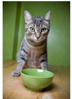
The first step is to stop free-feeding dry food.