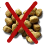
Ditch the dry.

Cats evolved as desert creatures, so they naturally have a low thirst drive. Cats that are fed a dry, kibble diet risk being chronically dehydrated, increasing the risk of urinary and kidney problems. Dry foods are about 10% moisture and even with the water they drink, cats on a dry diet only get about half the liquid of a cat on a canned or raw diet that has a 60-70% moisture content.