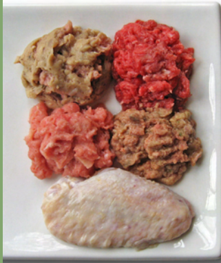
An assortment of ground raw diets and whole bone-in cuts.

Felines have lost the ability to process carbohydrates very well. Excess carbohydrates in the diet, especially grains, can lead to obesity, diabetes and serious digestive problems. Cats get most of their energy requirements from glucose their livers process from protein, not carbohydrates.