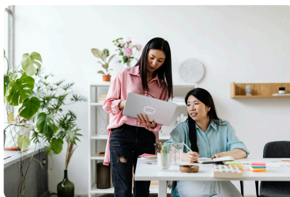
Auction Items – Can be a hobby, or a service!