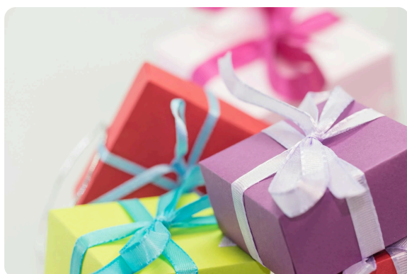
Lucky Door Prizes