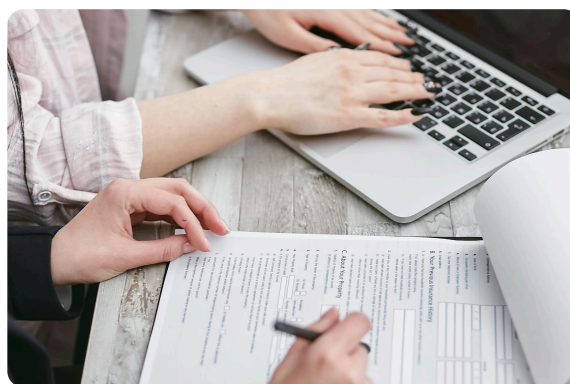
Legal registration of VK Nũ as a Not-for-Profit