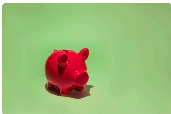
Cost of running events