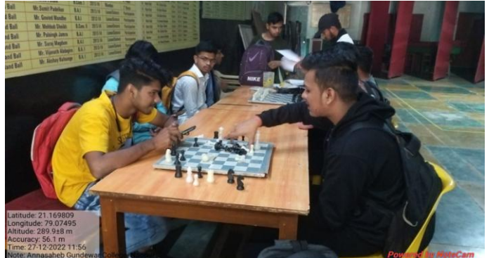
Latitude: 21.169809 Longitude: 79.07495 Altitude: 289.9±8 m Accuracy: 56.1 m Time: 27-12-2022 11:56 Note: Annasaheb Gundewar College, Nagpur