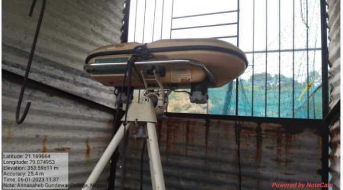
Latitude: 21.169664 Longitude: 79.074953 Elevation: 353.59±11 m Accuracy: 25.4 m Time: 06-01-2023 11:37 Note: Annasaheb Gundewar College, Nagpur