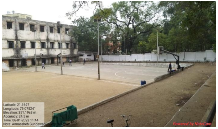
Latitude: 21.1697 Longitude: 79.07541 Elevation: 351.19±3 m Accuracy: 24.5 m Time: 06-01-2023 11:44 Note: Annasaheb Gundewar College, Nagpur