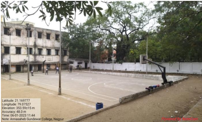
Latitude: 21.169777 Longitude: 79.07527 Elevation: 353.59±15 m Accuracy: 48.0 m Time: 06-01-2023 11:44 Note: Annasaheb Gundewar College, Nagpur