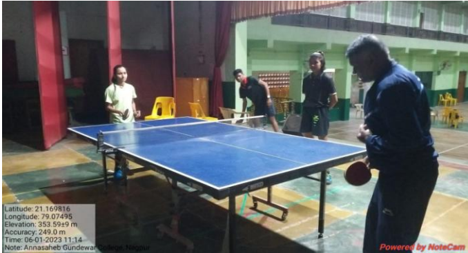
Latitude: 21.169816 Longitude: 79.07495 Elevation: 353.59±9 m Accuracy: 249.0 m Time: 06-01-2023 11:14 Note: Annasaheb Gundewar College, Nagpur