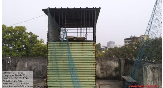
Latitude: 21.16968 Longitude: 79.074722 Elevation: 353.59±17 m Accuracy: 26.7 m Time: 06-01-2023 11:35 Note: Annasaheb Gundewar College, Nagpur