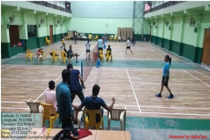
Latitude: 21.169823 Longitude: 79.07494 Elevation: 353.59±8 m Accuracy: 52.4 m Time: 27-12-2022 11:56 Note: Annasaheb Gundewar College, Nagpur