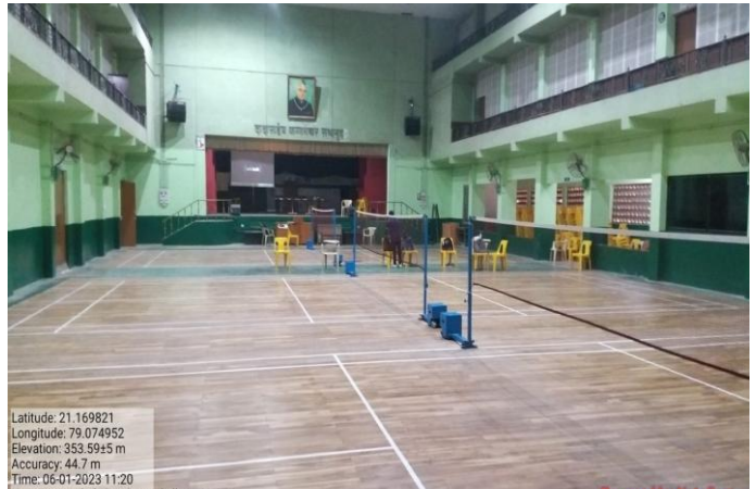
Latitude: 21.169821 Longitude: 79.074952 Elevation: 353.59±5 m Accuracy: 44.7 m Time: 06-01-2023 11:20 Note: Annasaheb Gundewar College, Nagpur