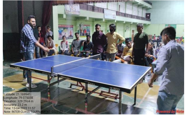
Latitude: 21.169941 Longitude: 79.075038 Elevation: 329.29±4 m Accuracy: 23.2 m Time: 13-04-2022 11:57 Note: INTER CLASS TOURNAMENT-2021-22