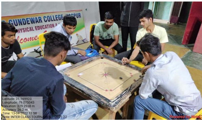
Latitude: 21.169923 Longitude: 79.075043 Elevation: 329.29±8 m Accuracy: 26.2 m Time: 13-04-2022 11:58 Note: INTER CLASS TOURNAMENT-2021-22