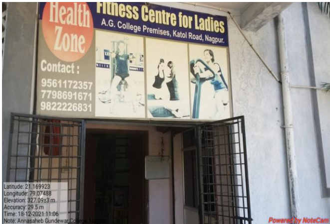
Latitude: 21.169923 Longitude: 79.07498 Elevation: 327.09±3 m Accuracy: 29.5 m Time: 18-12-2021 11:06 Note: Annasaheb Gundewar College, Nagpur