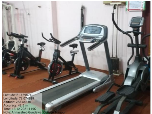
Latitude: 21.169574 Longitude: 79.074989 Altitude: 263.4±8 m Accuracy: 42.5 m Time: 18-12-2021 11:02 Note: Annasaheb Gundewar College, Nagpur