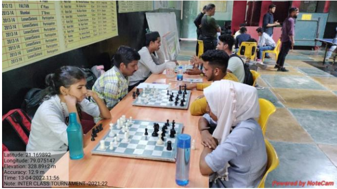
Latitude: 21.169892 Longitude: 79.075147 Elevation: 329.89±2 m Accuracy: 12.9 m Time: 13-04-2022 11:56 Note: INTER CLASS TOURNAMENT-2021-22

Website: www.gundewarcollege.com , E mail: info@gundewarcollege.com , ag_college@yahoo.in