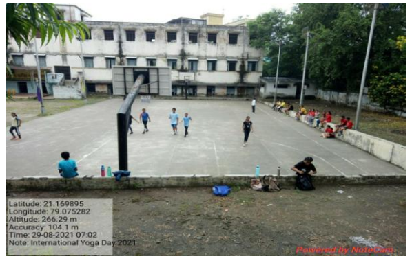
Latitude: 21.169895 Longitude: 79.075282 Altitude: 266.29 m Accuracy: 104.1 m Time: 29-08-2021 07:02 Note: International Yoga Day-2021