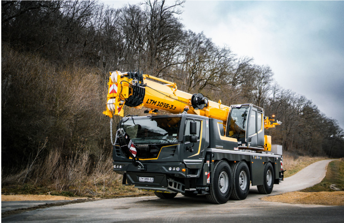
The LTM 1055-3.3 redefines mobility as a lightweight 3-axle all-terrain crane.