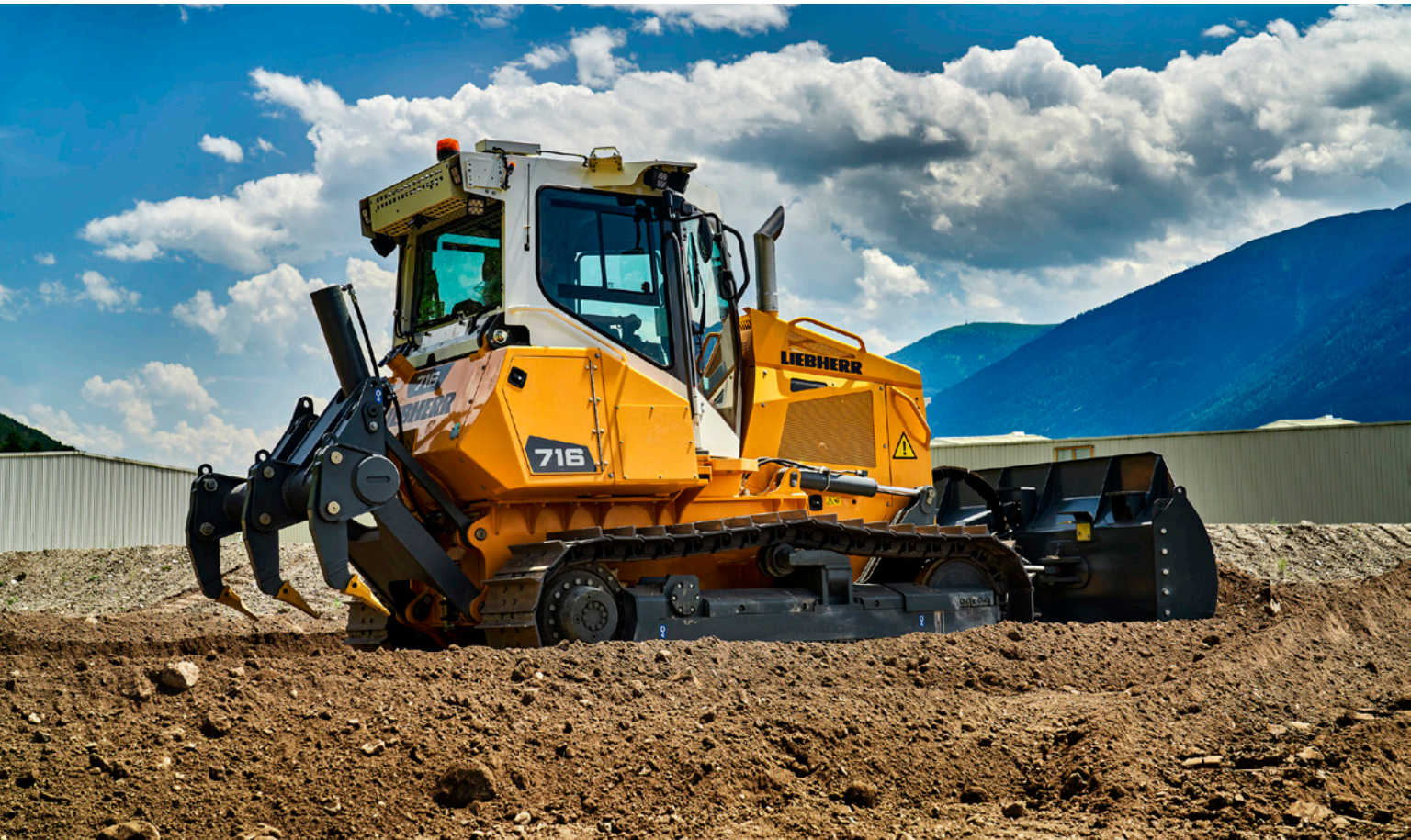
Liebherr continues to invest in the latest in construction equipment technology.