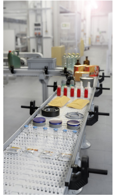
From electronics to consumer goods, VarioFlow plus fits multiple transport applications.

For conveyor technology, the topic of sustainability and energy efficiency continues to be an important subject. Although conveyors have not really changed in 40+ years, the industry is attempting to build more with less components. Can we run a large system with twenty motors instead of thirty? If we focus on energy efficiency when choosing conveyor designs, can we increase service time between maintenance intervals?