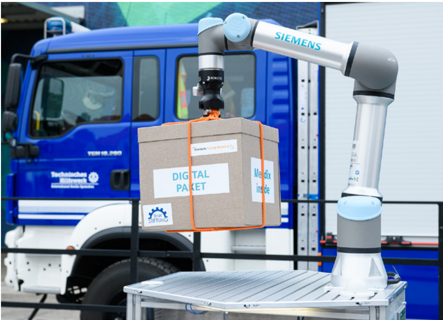
Robotics can stabilize throughput by performing repetitive tasks like pick-and-place, case packing, and palletizing with high precision and reliability.