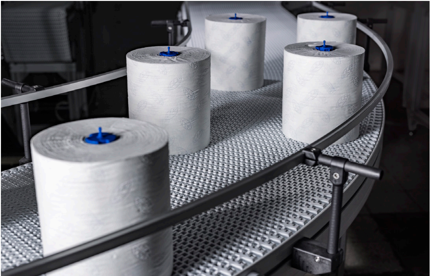
The VarioFlow belt conveyor from Bosch Rexroth ensures smooth transport with high adaptability, reliability, and easy integration.

Matthew Jaster, Director, Editorial Content