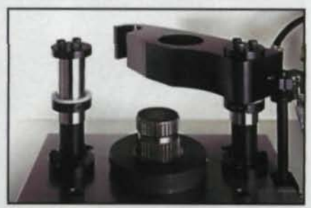
A short broach sticks out of the HS-100 deposit table and ring nozzle, below the machine tool's hold-down bar. The broach uses multiple up-and-down strokes to provide internal gears with the surface roughness of ground gears.

Each diamond-coated short broach has a lifetime of 200-300 meters of broaching length and a cycle time of