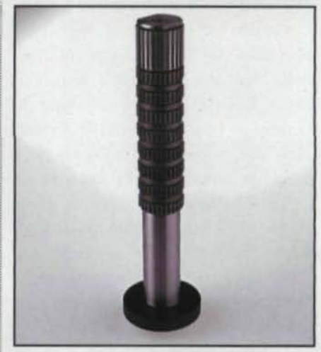
Fässler Corp.'s multiple-stroke short broaches, like this one, can finish-broach internal gears with small diameters and heat-treat distortion. A gear's major diameter can be as small as 20 mm.

Thus, the short broach grinds heattreat distortion from internal gears, giving them their proper profile, within their tolerance range. The broach provides such accuracy whether it's new or old.