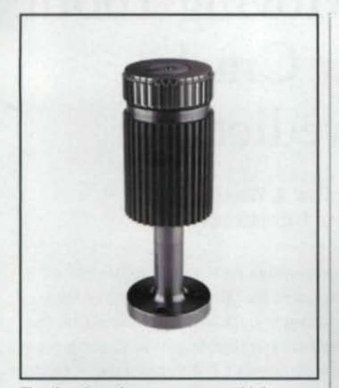
The short broach centers a gear with its upper set of teeth, then removes stock and flattens the gear's profile with the lower set of teeth.

20-40 seconds to finish an internal gear.