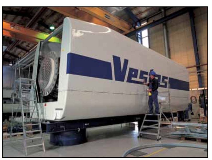
Vestas is one of a small number of European turbine manufacturers dominating the market that have strong relationships with trusted gearbox suppliers. This makes market entry more challenging for U.S. gear companies (courtesy of Vestas).

painted by market forecasts and statistics, there are issues and challenges for U.S.-based manufacturers seeking entry to the wind market. The current global market is dominated by a small number of European turbine manufacturers-Gamesa and Vestas are two of the largest. They have very strong relationships with trusted gearbox suppliers. "The Europeans have a different mindset about doing business," Garran