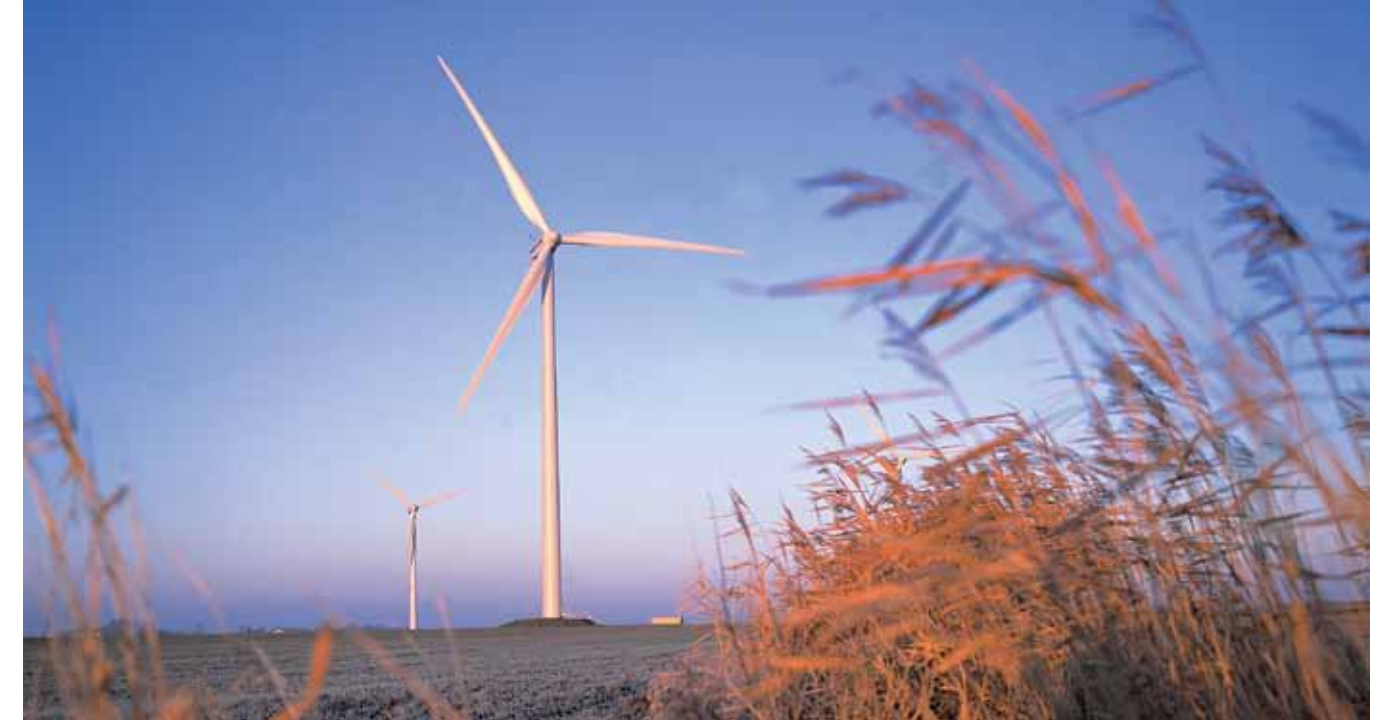
Wind market forecasts and statistics paint a positive picture for the future, but there are issues and challenges for U.S.based manufacturers seeking entry to the gearbox supply chain.