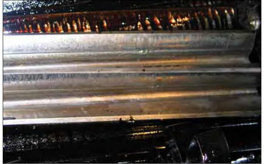
A kiln gear set showing distress due to insufficient viscosity (courtesy Rexnord Gear Group/Rexnord Industries LLC).