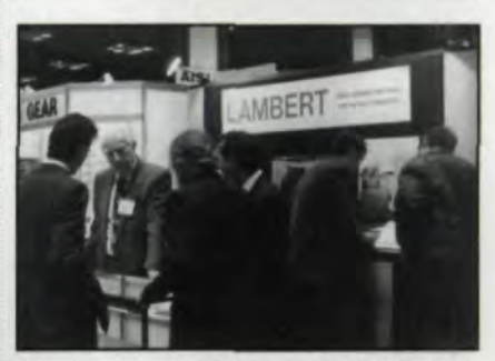
Top: The "gearless" Fellows FS 180 Mark III Hydrostroke gear shaper in action. Bottom: The Lambert AG booth featured affordably priced mechanical hobbers for fine-pitch gears.