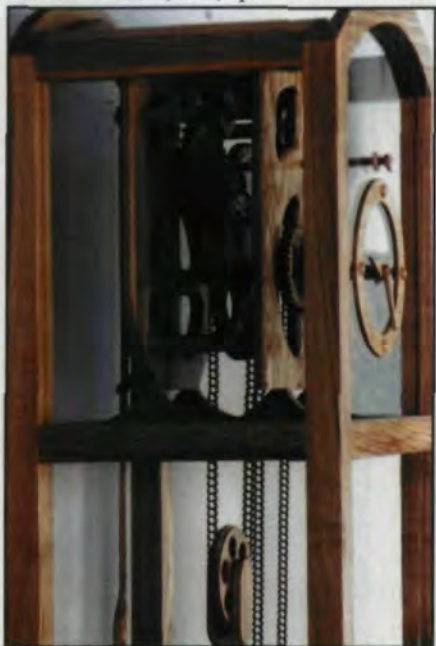
A wooden geared clock.

The Addendometer: If you've read this far on the page and enjoyed it, please circle 225.