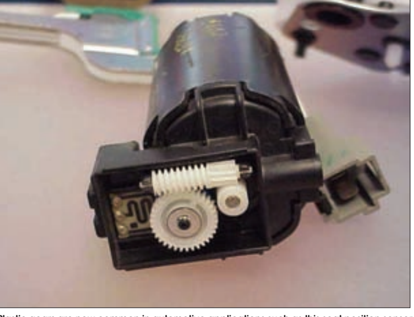
Plastic gears are now common in automotive applications such as this seat position sensor from ABA-PGT.

He adds, however, that those opportunities will also require more than newly engineered plastics. "Greater penetration in under-the-hood applications will require continued advances not only in materials technology, but in gear design and processing technology as well."