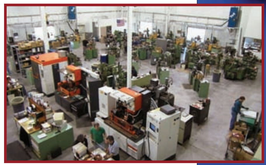
Injection-molded gear manufacturers like ABA-PGT are at the leading edge of plastic gear manufacture.

Plastic Gears— A Growing Industry Still Seeking Respect