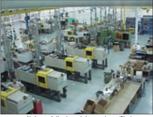
Not your father's metal gear shop.

He adds that to prevent part variation, it is vital that the injection molder have extensive experience and knowledge in gear making as they pertain to controlling: material conditioning; time and temperature (must be held to the