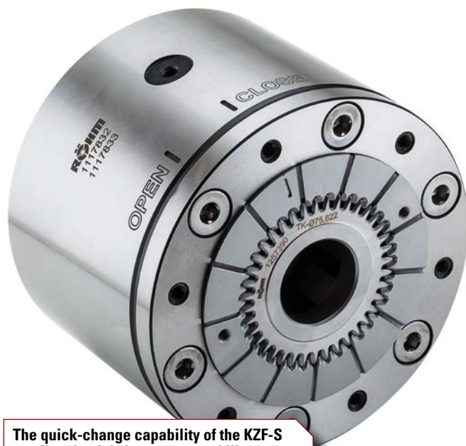
The quick-change capability of the KZF-S collet chuck is key to repeatability.

Global Gear is a Downers Grove, Illinois-based manufacturer serving Tier 1 and Tier 2 diesel engine OEMs and other engine manufacturers in the broad automotive and construction/agriculture industries. Their choice of workholding is the KZF-S collet chuck from Röhm, an external clamping chuck designed specifically for surface face grinding and hard turning gears.