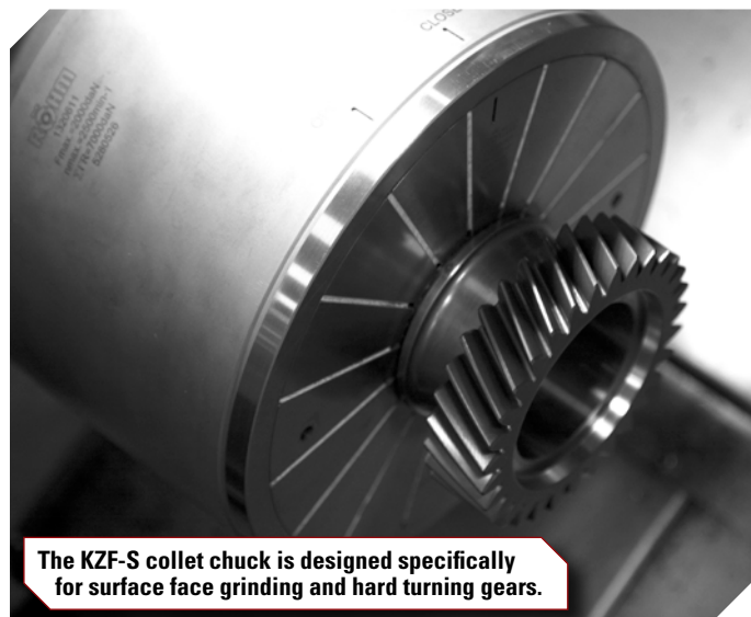
The KZF-S collet chuck is designed specifically for surface face grinding and hard turning gears.