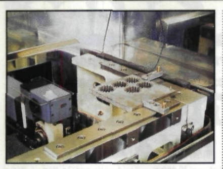
Fig. 3 — Stacked spur gears in an EDM.

completely through the mold insert, the final finish was obtained by using low current settings and a small circular orbit of approximately .0100 per side. The final finish required no further processing or polishing.