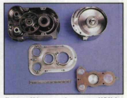
Fig. 1 — Airbag retraction actuator (ARA) for the Mars Pathfinder Lander.

Instead of using a wire electrode, a vertical EDM uses solid, pre-shaped electrodes typically made of copper or a special graphite refined specifically for EDM use. These electrodes are made with the obverse shape of the desired details. For example, a free-standing male pinion gear located against a shoulder would be machined with a female electrode. The electrodes used for this project were produced on the wire EDM using the same tooth geometry macro from the actual wire-cut gear program, providing identical part accuracies and matching gear geometry. During EDM machining, these electrodes are "burned" into the solid blank, eroding the workpiece and leaving a finished gear impression requiring no additional processing.