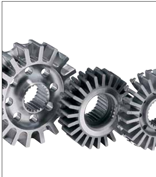
Wire EDM allows for increased accuracy, improved machining performance and a superior surface finish.

Mitsubishi/MC Machinery Systems, Agie Charmilles and Makino are three wire EDM companies that have experience working with gear manufacturers. With new machines and technologies debuting at IMTS in Chicago this September, there are more reasons for gear manufacturers to consider the benefits of having wire EDM equipment on their shop floors.