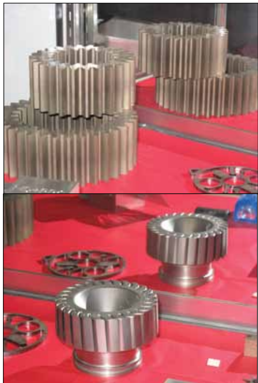
MC Machinery can cut basically any type of gear using wire EDM, except helical gears.

Hopwood Gear, located in Manchester, England, uses wire EDM technology to manufacture straight spur gears, internal and external. Any type of modifications can be made to the gear teeth for tip corrections and root alterations. "Unfortunately, helical gears cannot be manufactured using this method," Hopwood says. "It's a time-consuming process, and there's a fine line between the cost of tooling versus cost of time for large quantity