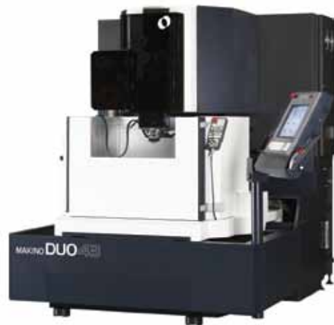
Makino's wire EDM machines allow users to do multiple parts with a great deal of flexibility.

“HEAT is designed for applications where flushing is difficult or impossible,” Coward says. “With this technology, we can maintain a good cutting speed and actually increase the