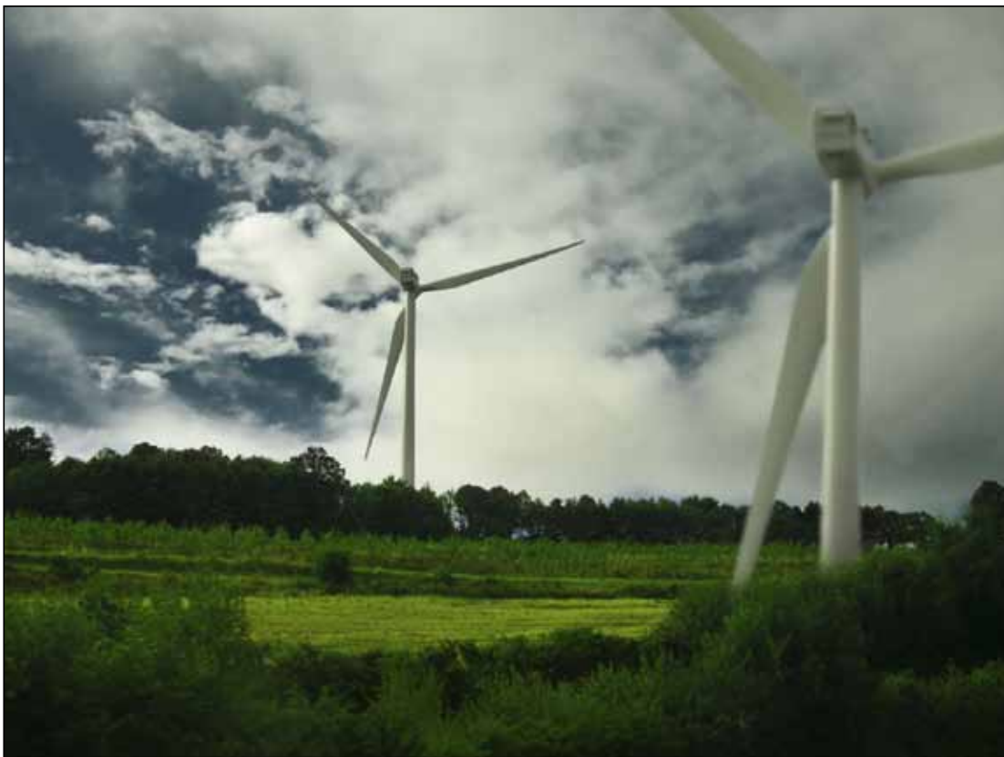
Green Energy.

It has often been reported that when the legendary—but true-to-life—bank robber and certified colorful character Willie Sutton was asked why he concentrated on robbing banks, his simple, reasonable reply was, “Because that’s where the money is.” But that’s not quite accurate. What he did say—in an autobiographical sketch—was “Go where the money is. And go there often.”