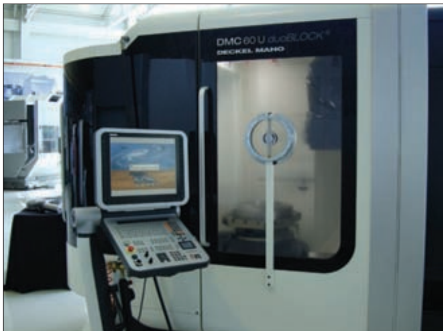
Most new DMG machines can be equipped with the gear milling technology.

few standard options, such as a B- or A-axis, touch probe, Blum laser and 3-D quickset.