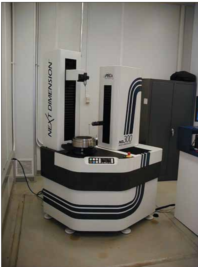
The ND300 from PECO fit perfectly with the gear measuring needs at Schafer Gear thanks to its service and support benefits.