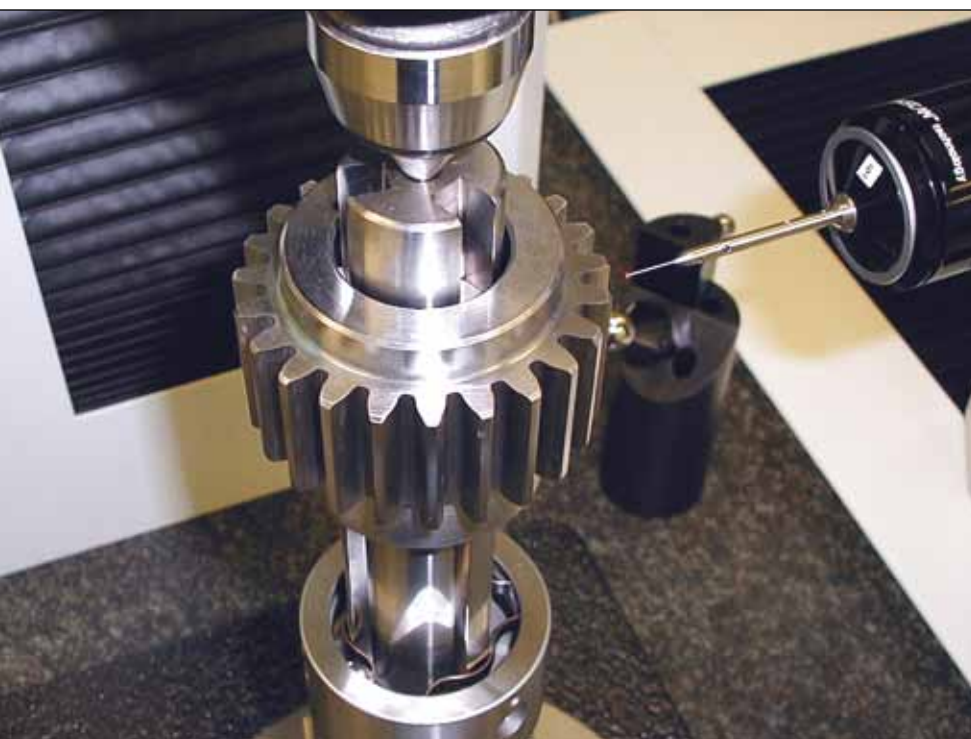
The ND300 comes with a three-year warranty, telephone service response and remote software support.

I can recall anything I need to. The network capabilities are a huge advantage for us."