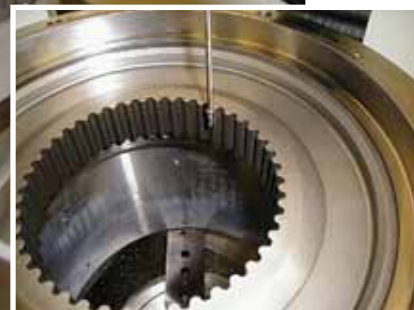
PECo's data acquisition and Renishaw 3-D probe technology enables the machine to generate measurements on various surfaces (All photos courtesy of PECo).