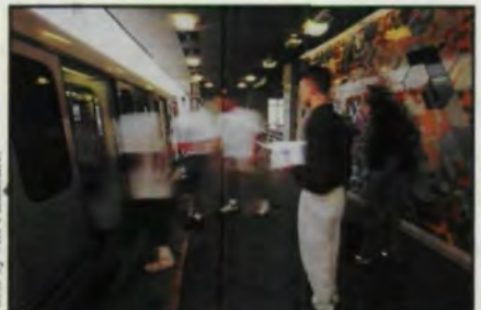
Detroit People Mover.

Tell Us What You Think .... If you found this article of interest and/or useful, please circle 210.