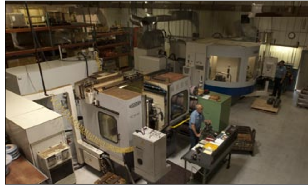
Custom Gear and Machine's new Reishauer RZ-400 helps them cut cycles times to a fraction of what they were using an older machine.

er and add-ons of materials and part handling devices."