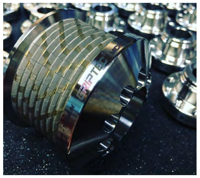
ZPE manufactures pulley and receiver systems for over 20 different supercharger genres in all sizes and rib configurations.

ZPE manufactures pulley and receiver systems for over 20 different supercharger genres in all sizes and rib configurations. Receivers are typically 2 in., and the pulley diameters are between 26 in. Parts are machined from billet round bar stock, and -materials include 7075-T6 aluminum sourced