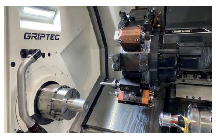
On the DMG units, parts are exclusively processed on Hainbuch collet and mandrel chucks. Starting on the main chuck and finishing on the mandrel, the entire part can be completed in just one cycle.

"Included with the chuck were several adaptations, including several MANDO Adapt units with segmented bushings for ID clamping, as well as a machinable end stop. The MANDO Adapt can be changed in less than two minutes.