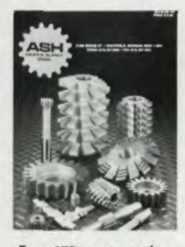
Free 450 page catalog available upon request.