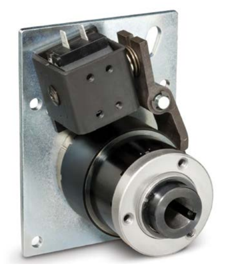
Industries such as packaging and labelling are cost-conscious and as such require the equipment that they use to be cost-effective and reliable with minimal running costs.