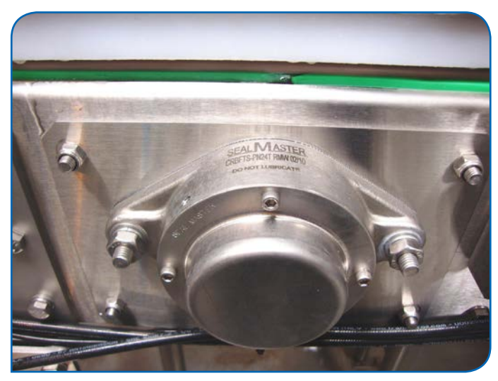
The added protection of end caps and backside shields can significantly prolong the life of a sealed bearing in clean-in-place and steam-in-place applications.

The a_3 factor adjusts for operating conditions, such as lubricant quality, presence of foreign matter, conditions that cause changes in material properties, unusual loading or mounting conditions. Mounted bearings are typically slip fitted to the shaft and rely on features such as inner race length and the locking device for support. ABMA recommends an a_3 factor of 0.456 for "slip fit" ball bearings. Shock and vibration can act as an additional load over and above the expected applied load, also requiring an a_3 life adjustment. Accurate determination of the a_3 factor often requires testing and infield experience.