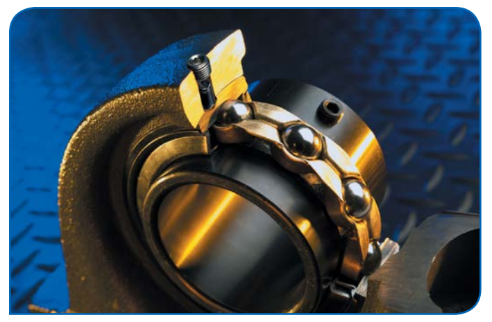
A retainer that rides on the outer ring land surface allows the balls to freely rotate in the cage pockets with a proper film of lube. A retainer that rides on the balls prevents the balls from rotating freely, so with every rotation grease is wiped from the ball.

Bearing manufacturers often provide "lubed-for-life" mounted bearings with a plug in the housing in place of a grease fitting, and some may add extra grease. In addition, you may see a tapered land design that helps direct lubrication back into the raceway. Then consider certain retainer designs can help a bearing run cooler. Even with these fea-