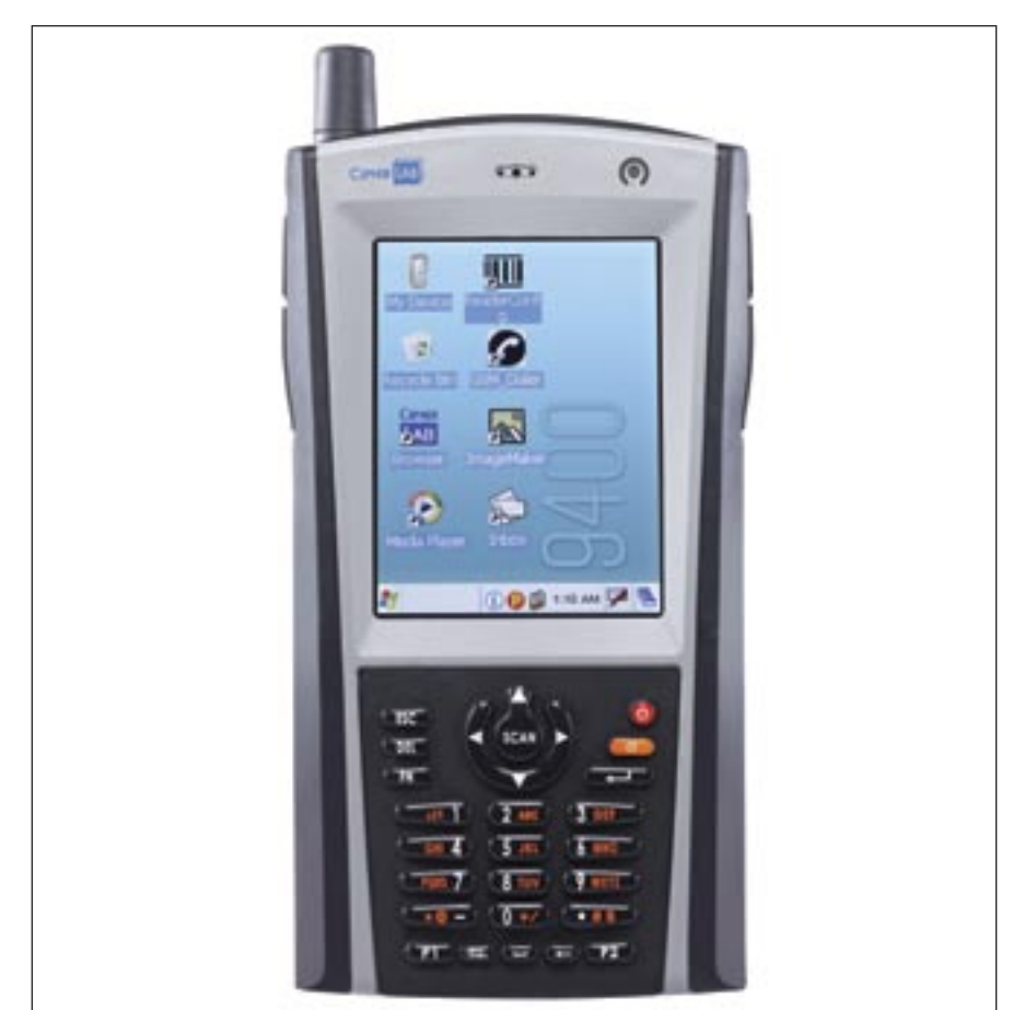
The CipherLab 9400 handheld mobile computer was an attractive product to Instamation Systems for pairing with the Roundskeeper software due to its ease of use, compactness, embedded Microsoft Windows CE 5.0 operating system, large bright screen, good construction and low cost of ownership.

The product collaboration was put together by BlueStar, a distributor of RFID, Auto ID, POS and other mobility products. "BlueStar introduced me to the product after I solicited their