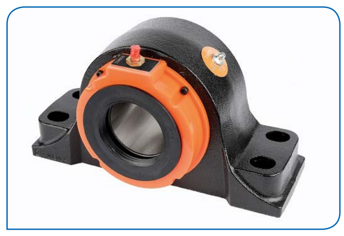
Timken Type E Tapered Roller Bearing Housed Unit Secondary Sealing System.

The third Manufacturer Excellence Award for outstanding service to the end use customer was presented to The Timken Company for the Timken Type E Tapered Roller Bearing Housed Unit Secondary Sealing System. Timken recently made the most robust sealing system in the industry