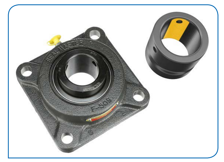
Regal Sealmaster Time Saving Axial Groove Mounted Ball Bearing.

The second Manufacturer Excellence Award was presented to Regal Power Transmission Solutions for the Sealmaster Time Saving Axial Groove Mounted Ball Bearing. The Sealmaster Time Saving Axial Groove Mounted Ball Bearing is available in both a medium 27/16" and up and standard 2 11/16" and up shaft sizes, the Time Saving axial groove in the inner ring bore allows for easier bearing removal. This design provides clearance from the burr created by the setscrew