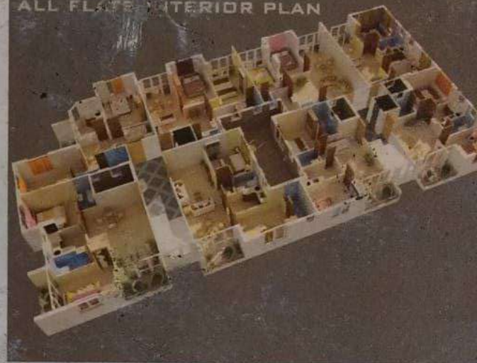
ALL FLATS INTERIOR PLAN