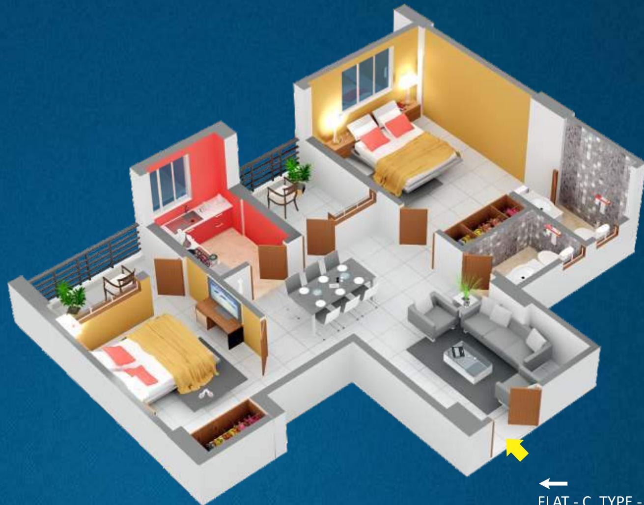
← FLAT - C, TYPE - 2BHK + 2T Saleable Area - 925 sqft