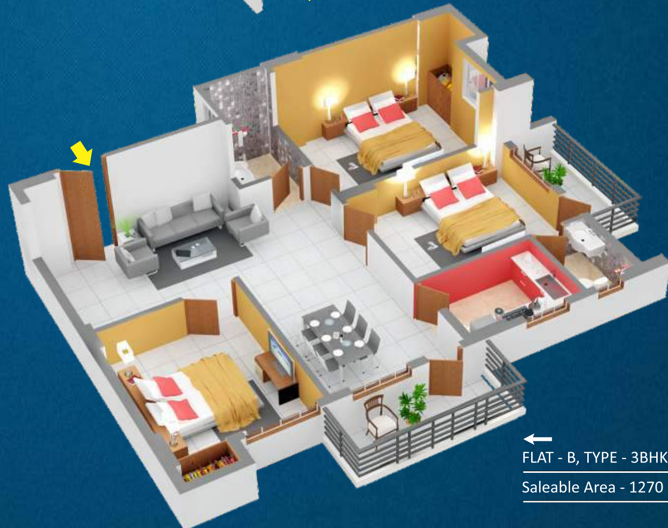
← FLAT - B, TYPE - 3BHK + 2T Saleable Area - 1270 sqft