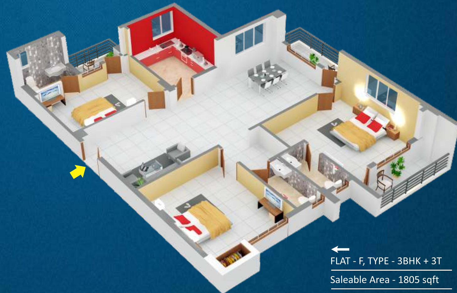
← FLAT - F, TYPE - 3BHK + 3T Saleable Area - 1805 sqft