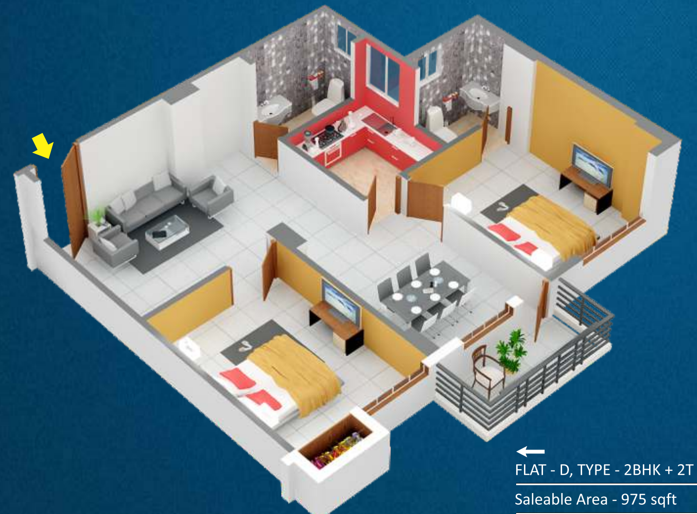
← FLAT - D, TYPE - 2BHK + 2T Saleable Area - 975 sqft