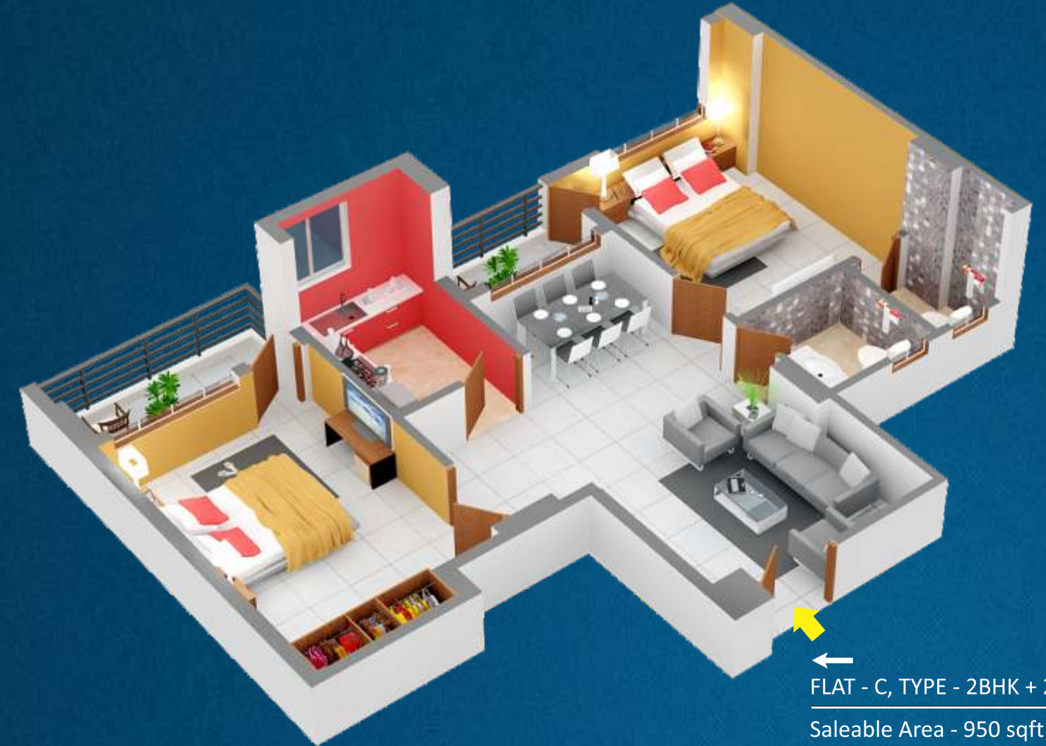
← FLAT - C, TYPE - 2BHK + 2T Saleable Area - 950 sqft