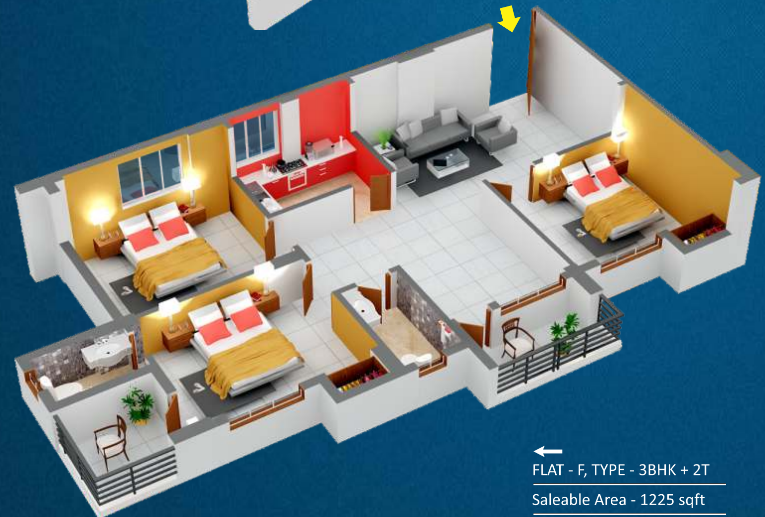
← FLAT - F, TYPE - 3BHK + 2T Saleable Area - 1225 sqft