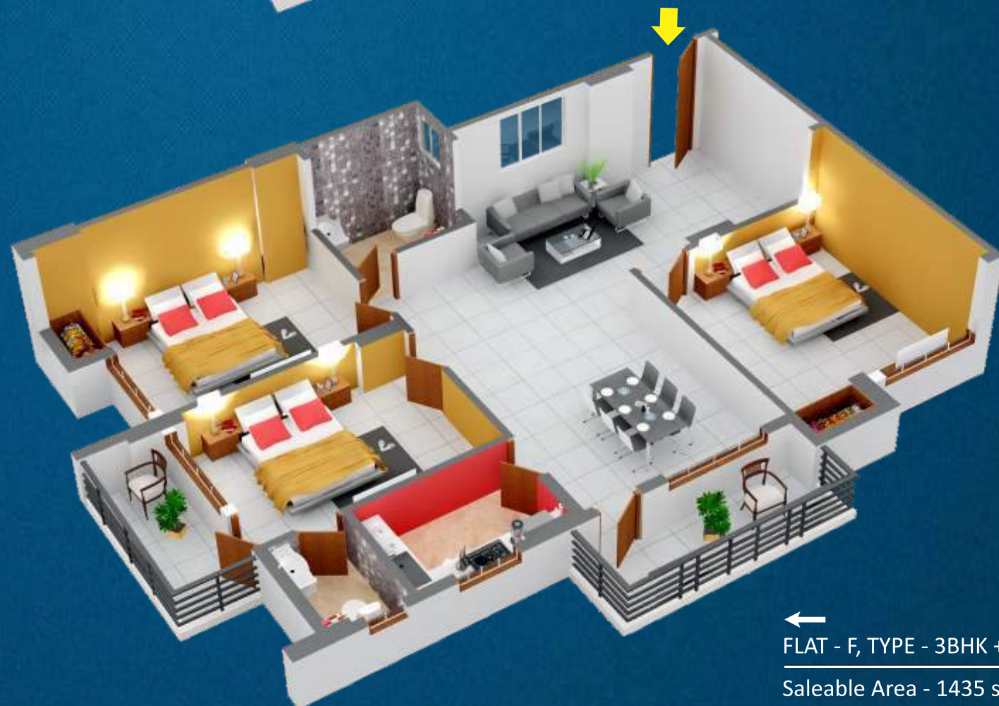
← FLAT - F, TYPE - 3BHK + 2T Saleable Area - 1435 sqft