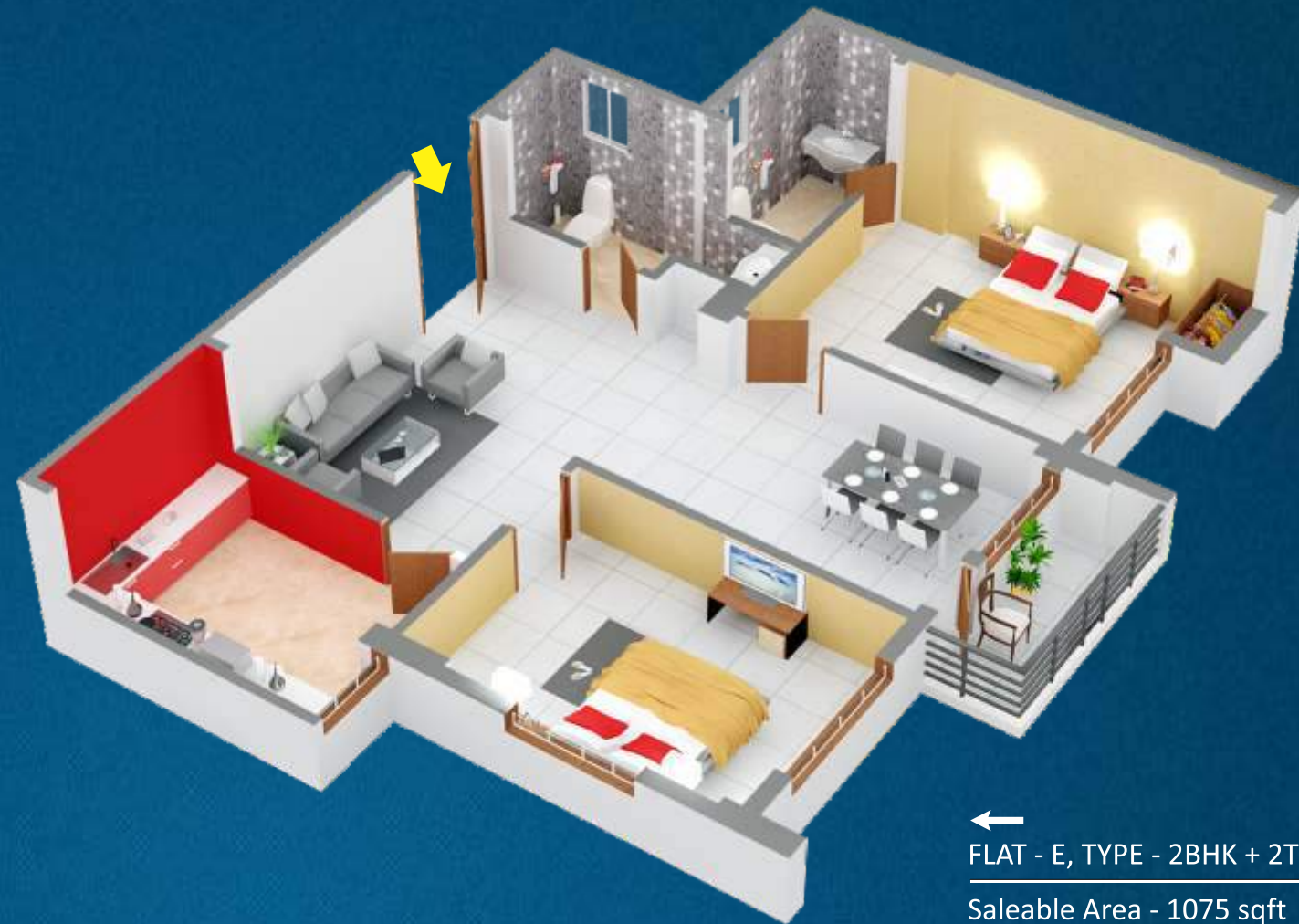
← FLAT - E, TYPE - 2BHK + 2T Saleable Area - 1075 sqft