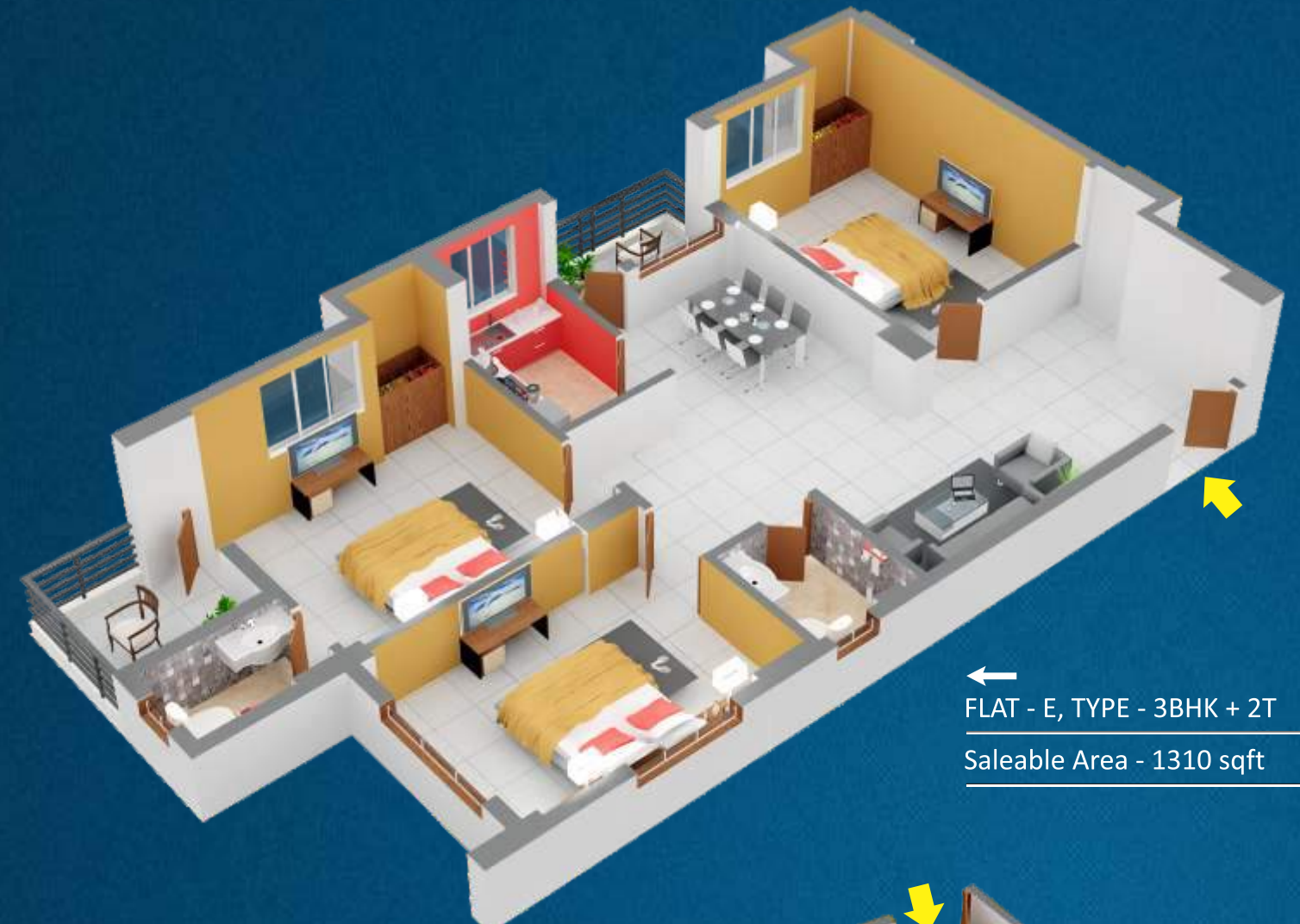
← FLAT - E, TYPE - 3BHK + 2T Saleable Area - 1310 sqft