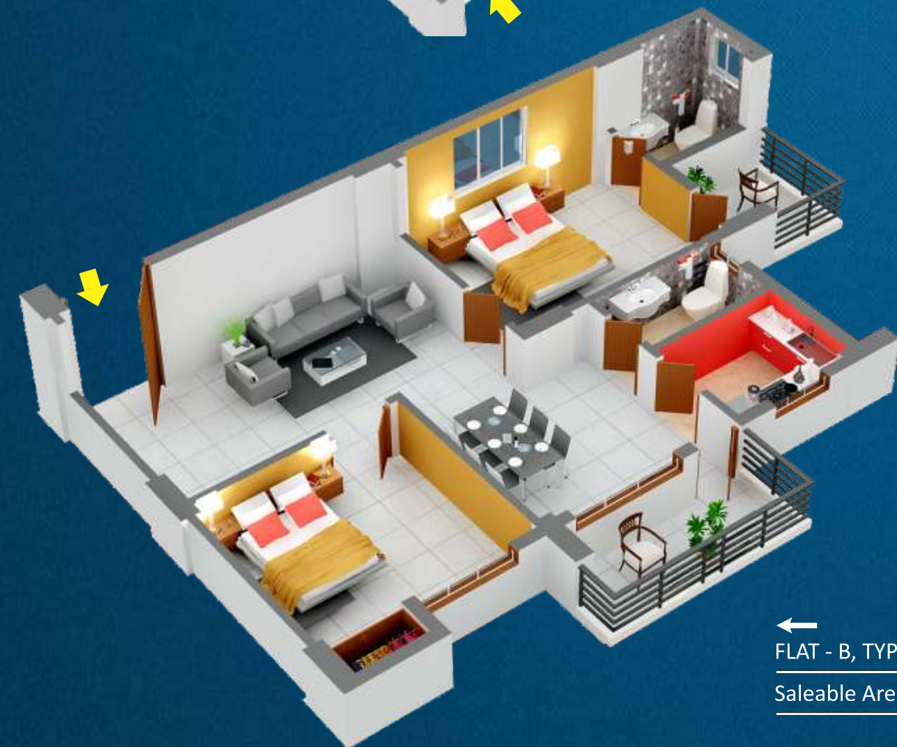
← FLAT - B, TYPE - 2BHK + 2T Saleable Area - 1025 sqft