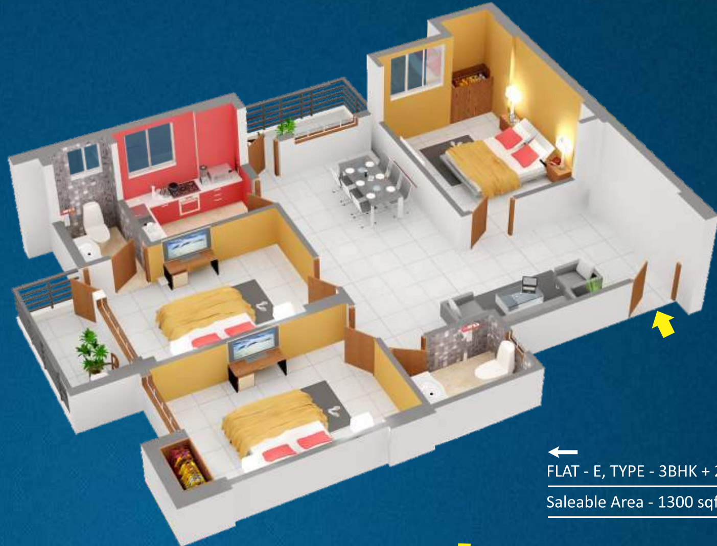
← FLAT - E, TYPE - 3BHK + 2T Saleable Area - 1300 sqft