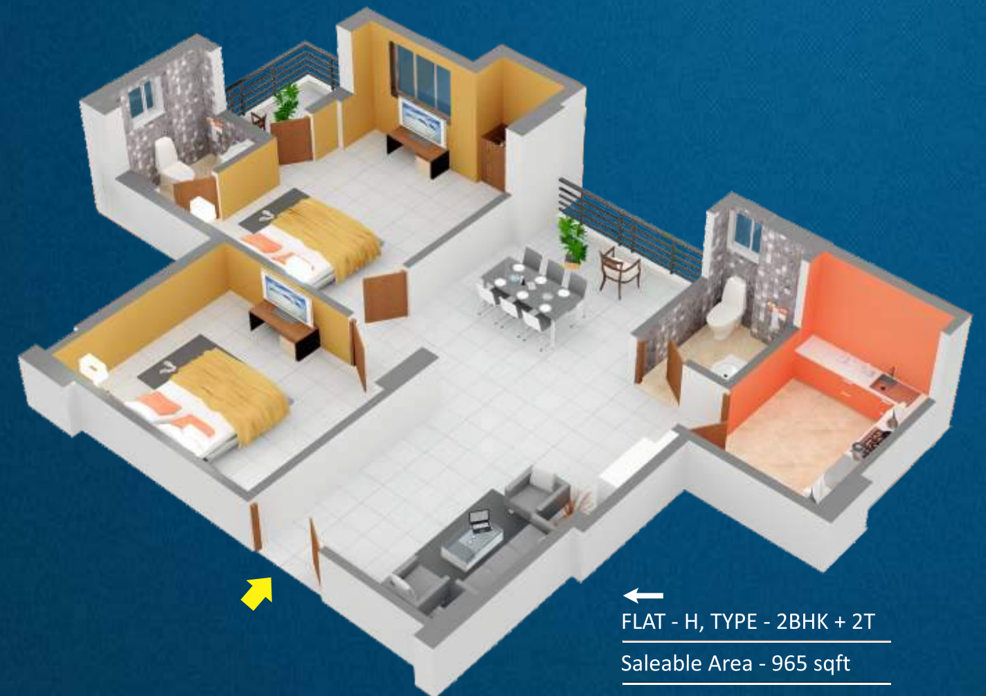
← FLAT - H, TYPE - 2BHK + 2T Saleable Area - 965 sqft