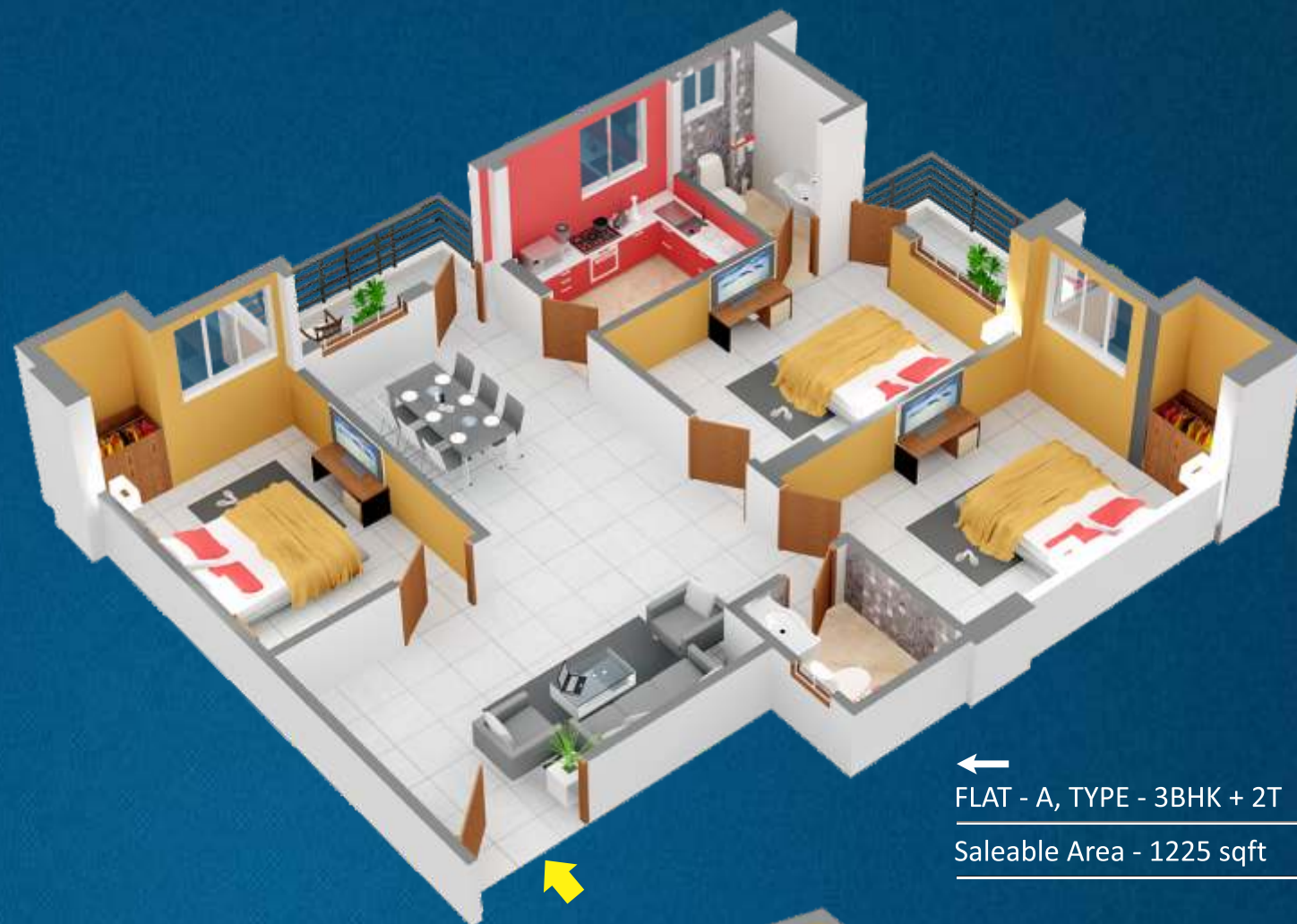
← FLAT - A, TYPE - 3BHK + 2T Saleable Area - 1225 sqft