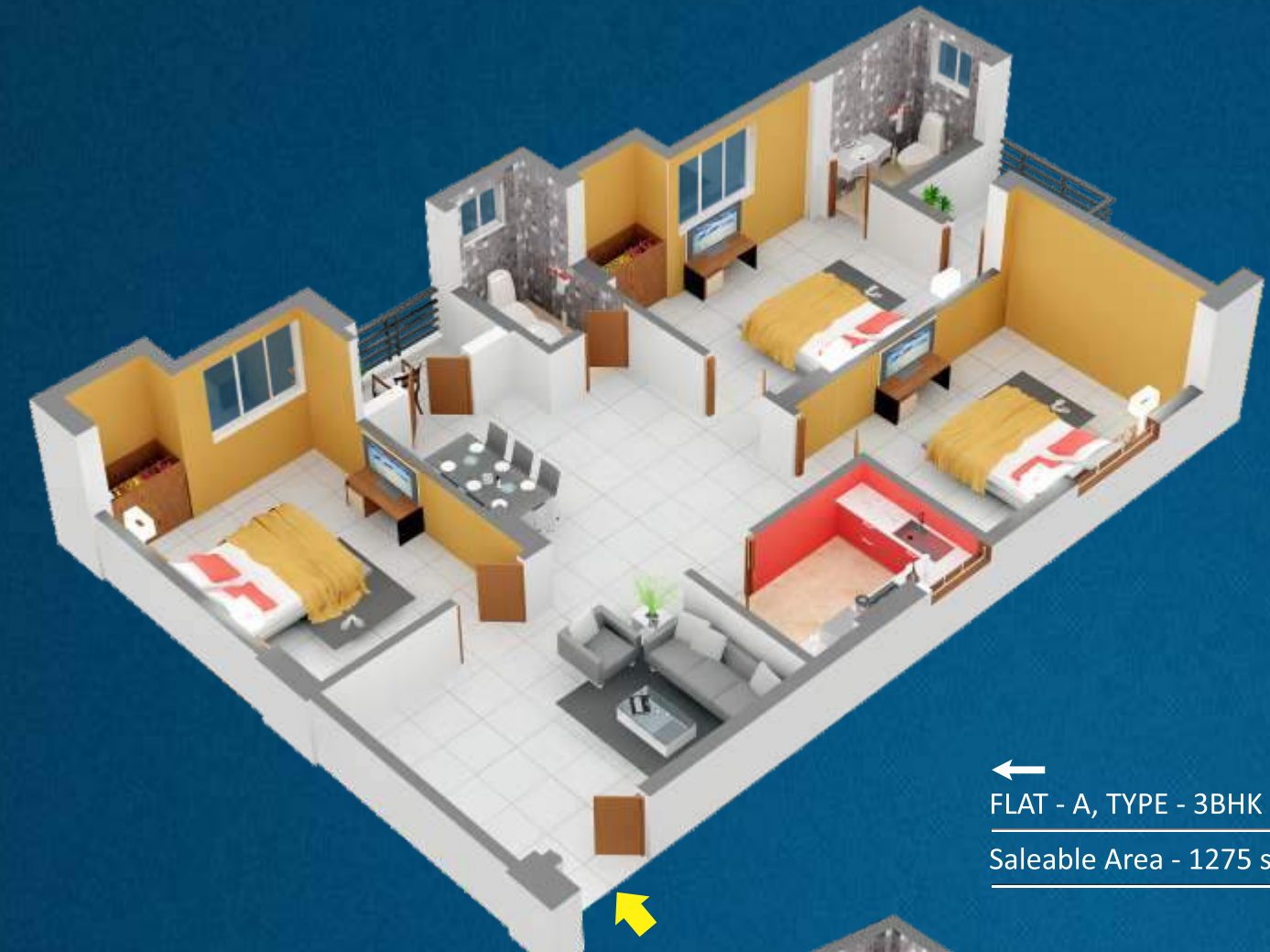
← FLAT - A, TYPE - 3BHK + 2T Saleable Area - 1275 sqft