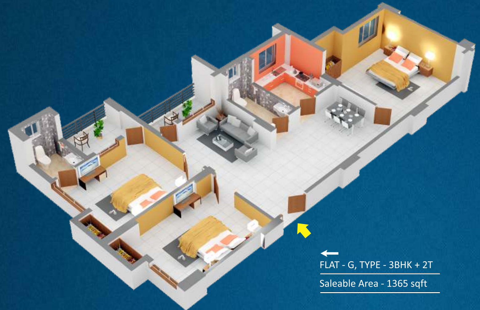
← FLAT - G, TYPE - 3BHK + 2T Saleable Area - 1365 sqft