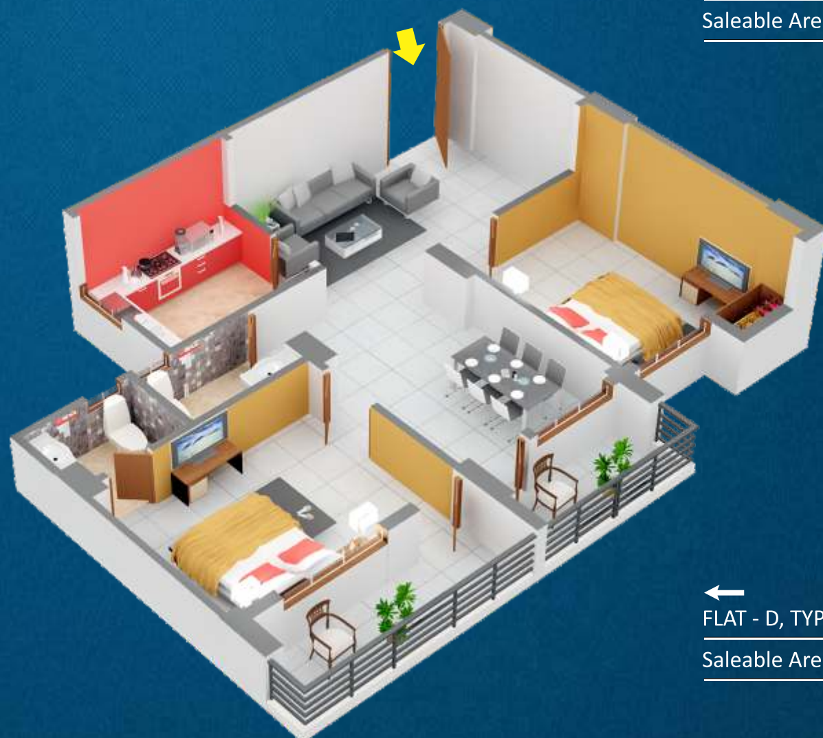
← FLAT - D, TYPE - 2BHK + 2T Saleable Area - 1050 sqft