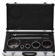
CUTTERS FOR WALL HOLES WITH A VIEW FOR CONCRETE 9-PIECE KIT HOLES 30-100 mm ADAPTERY SDS PLUS, SDS MAX