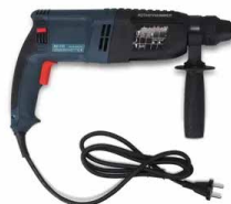
BOXER drilling hammer, BX-155, SDS + normal head, 2800W, case + accessories