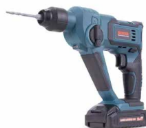
Boxer SR-Line Rotary Hammer Professional SDS + - Softgrip - With two 20.4 V batteries - Including 11 pieces of accessories