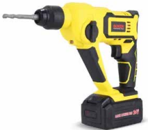
Cordless impact hammer sds 24.4v x 2 boxer sr – 148