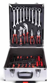
MEGA TOOL CASE 599 ELEMENTS BOXER BX - 599