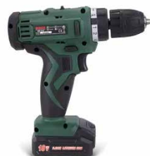
BIG SCREWDRIVER SET 2AKU18V DRILL