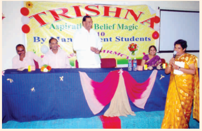
An event conducted for MBA Students - Trishna -2011

This association provides a platform for student to act as a industry - institute interface which instantly gives students a competitive edge. The practical exposure facilitates a better understanding of real world situations, thereby creating better adaptability to the workplace environment. Therefore, the learning experience is a constant interplay of classroom education and practical know how.