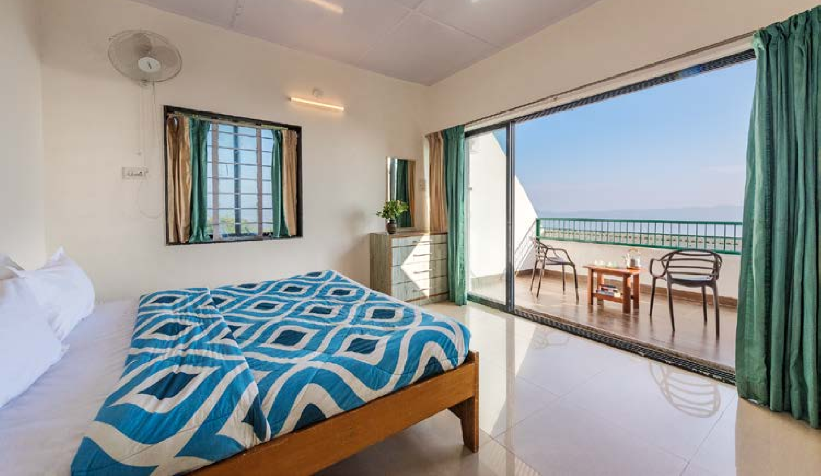
Balcony With Valley View