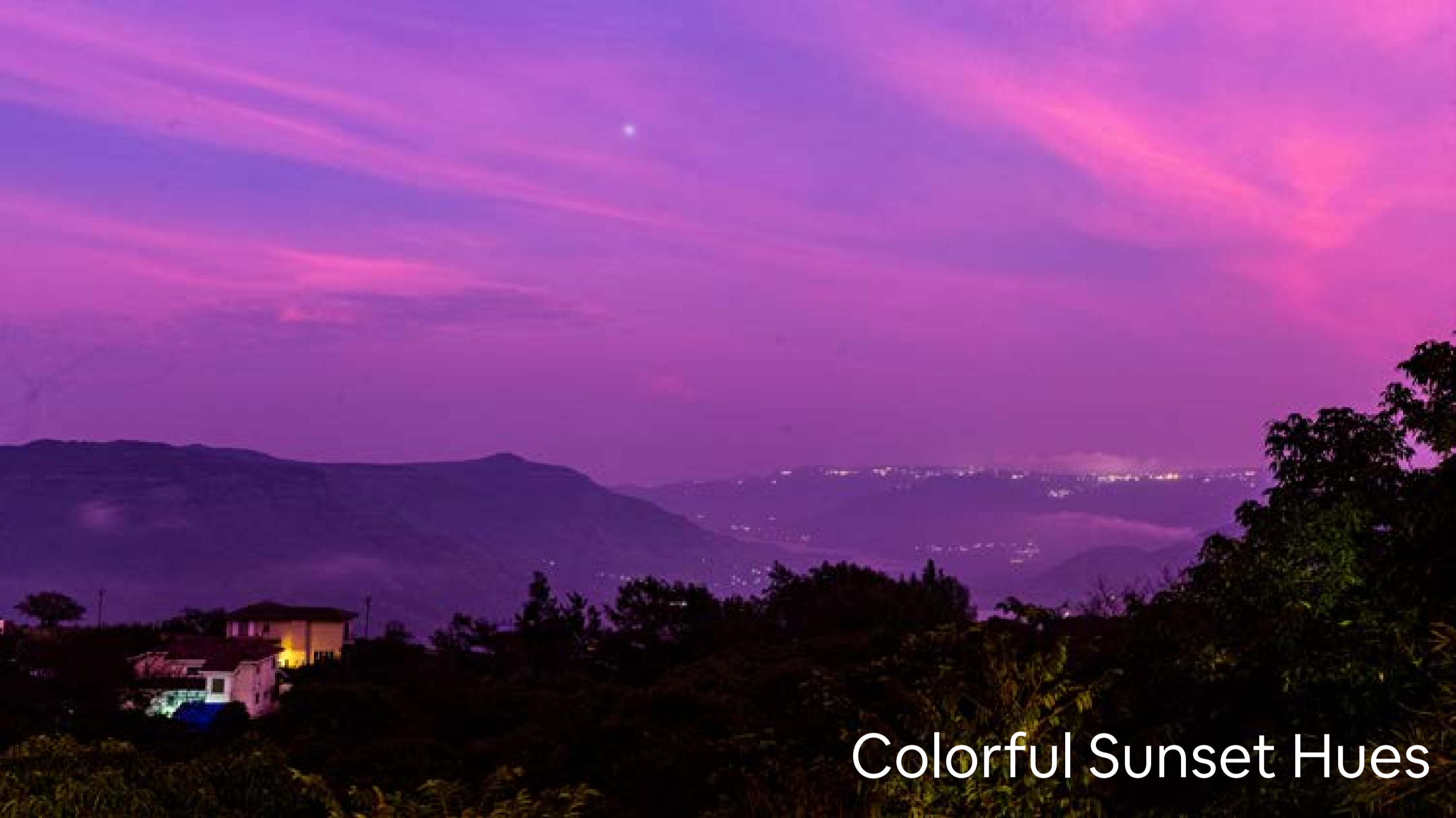
Colorful Sunset Hues