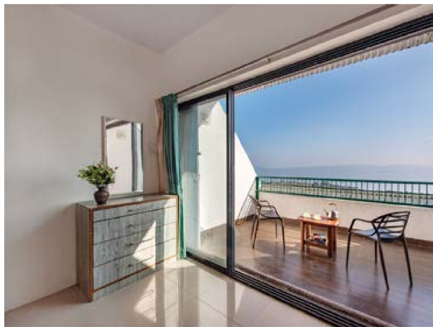
Top Floor Master Bedroom