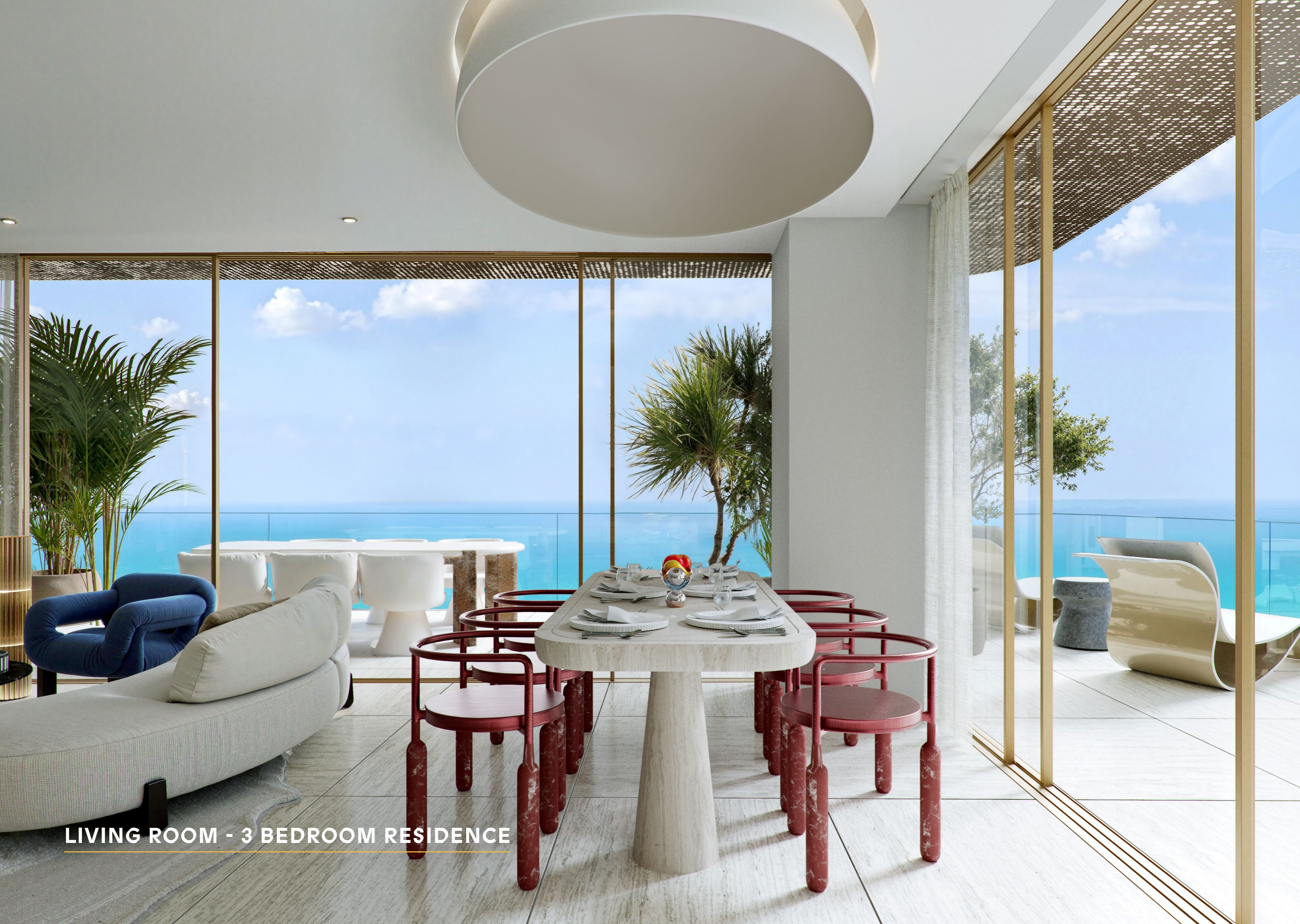
LIVING ROOM - 3 BEDROOM RESIDENCE