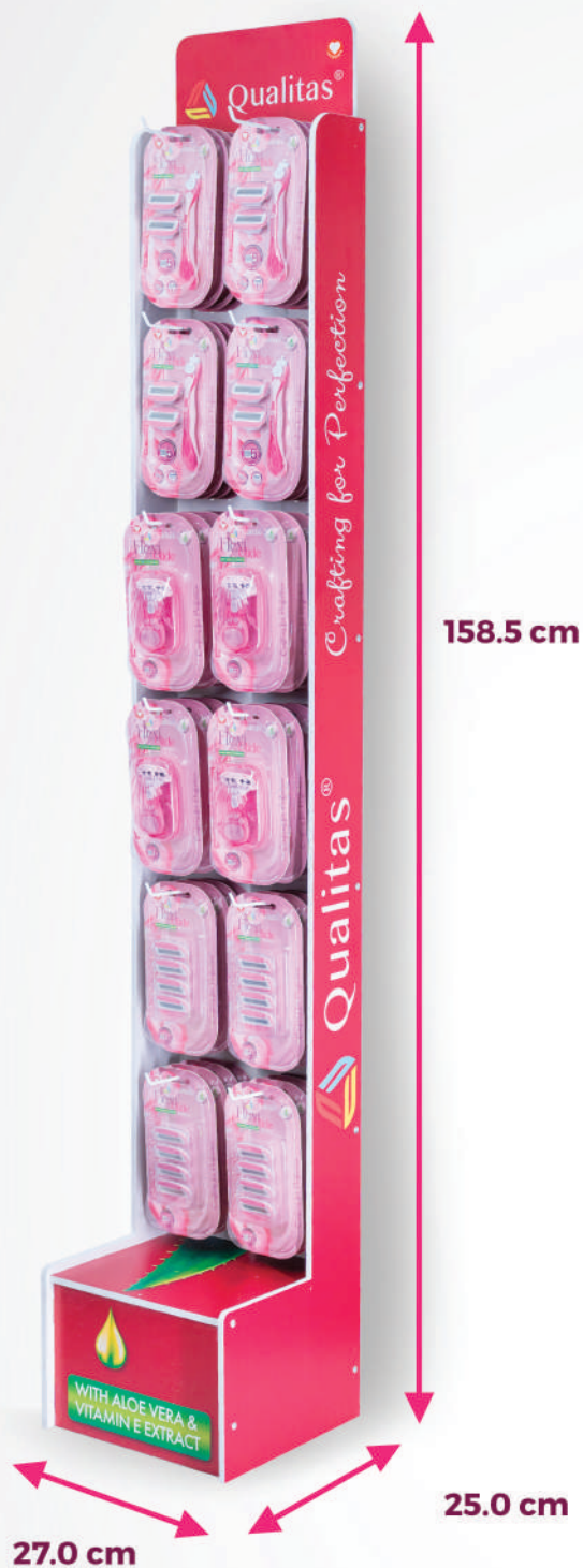
STQR-I12 12 HOOKS DISPLAY STAND