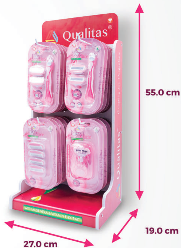
STQR-I04 4 HOOKS DISPLAY STAND