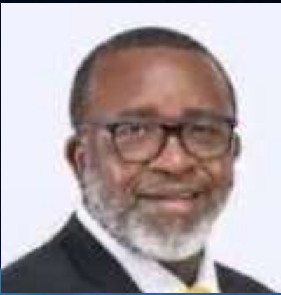
THE HON. MITHIKA LINTURI Minister of Agriculture, Livestock, Fisheries & Co-operatives KENYA