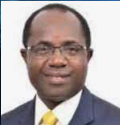
HON. MR. BWINO FRED KYAKULAGA Minister of State for Agriculture (MoSA) UGANDA