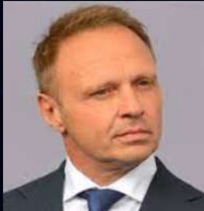
FRANCESCO LOLLOBRIGIDA Minister of Agriculture, Food Sovereignty and Forestry ITALY