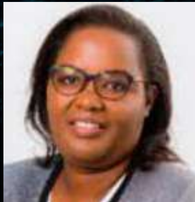
HON. MINISTER MUKESHIMAN Minister of Agriculture and Animal Resources RWANDA