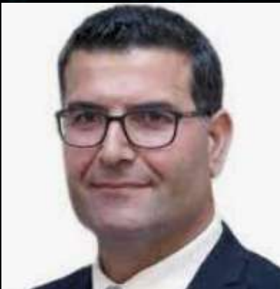
H.E ABBAS ALHAJJ HASAN Minister Of Agriculture THE REPUBLIC OF LEBANON