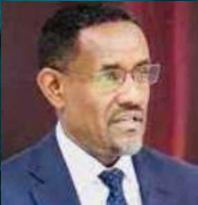
HON. OUMER HUSSIEN Minister of Agriculture ETHIOPIA