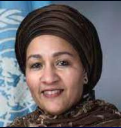
AMINA MOHAMMED Deputy Secretary General UNITED NATIONS