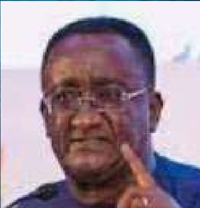
HE OWUSU AFRIYIE AKOTO Minister for Food & Agriculture GHANA