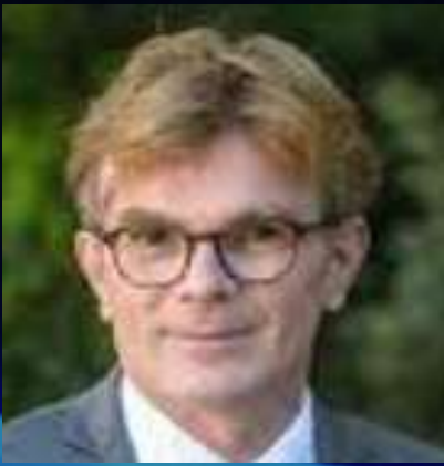
MARC FESNEAU Minister of Agriculture & Food Sovereignty FRANCE