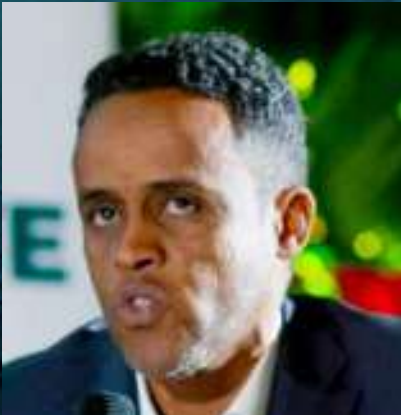
HON. HUSSEIN MOHAMED BASHE Minister of Agriculture UNITED REPUBLIC OF TANZANIA