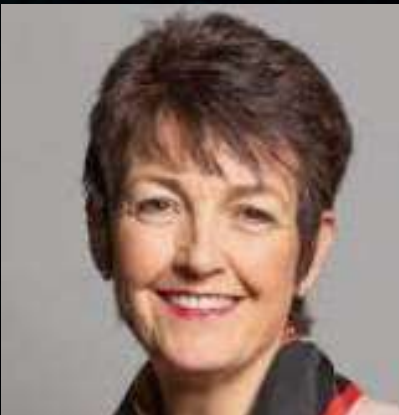
H.E. JOHANNA CHURCHILL Minister for Agri-Innovation & Climate Adaptation UNITED KINGDOM