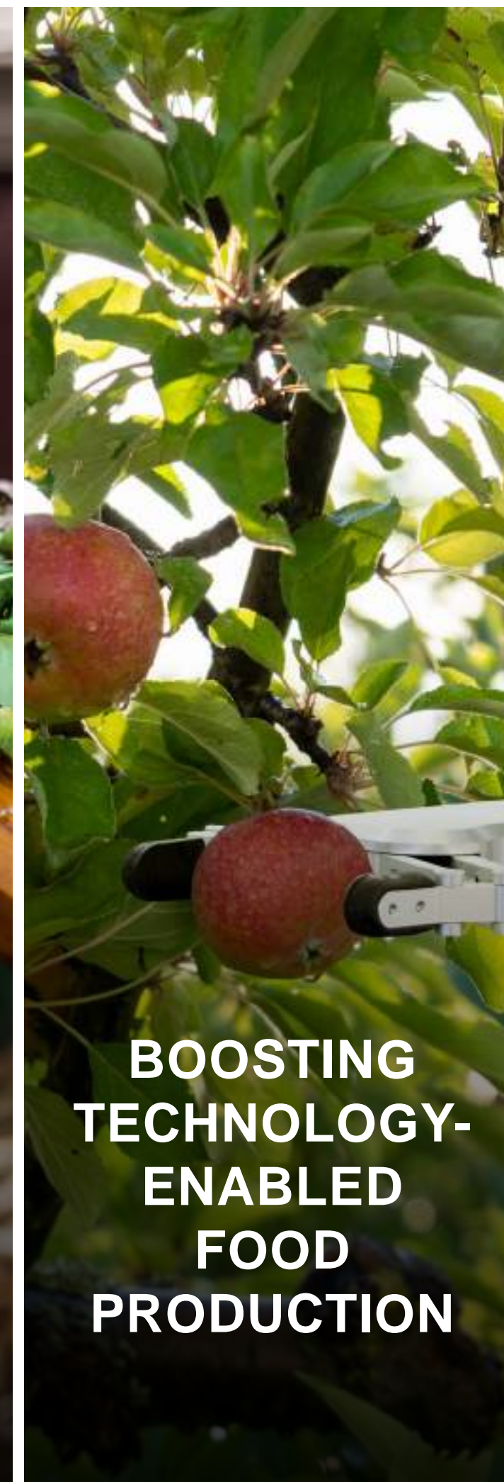
BOOSTING TECHNOLOGY- ENABLED FOOD PRODUCTION