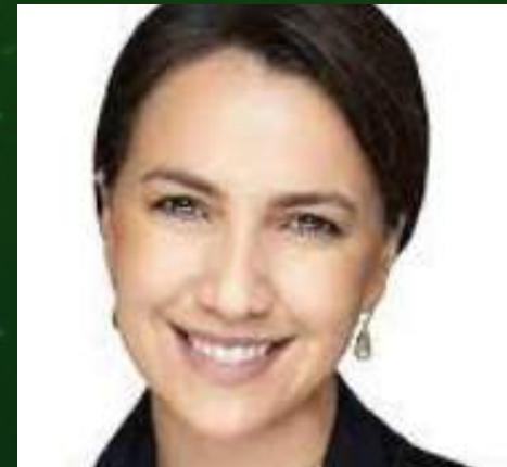
H.E. MARIAM AL MHEIRI

UAE Minister of Climate Change and Environment