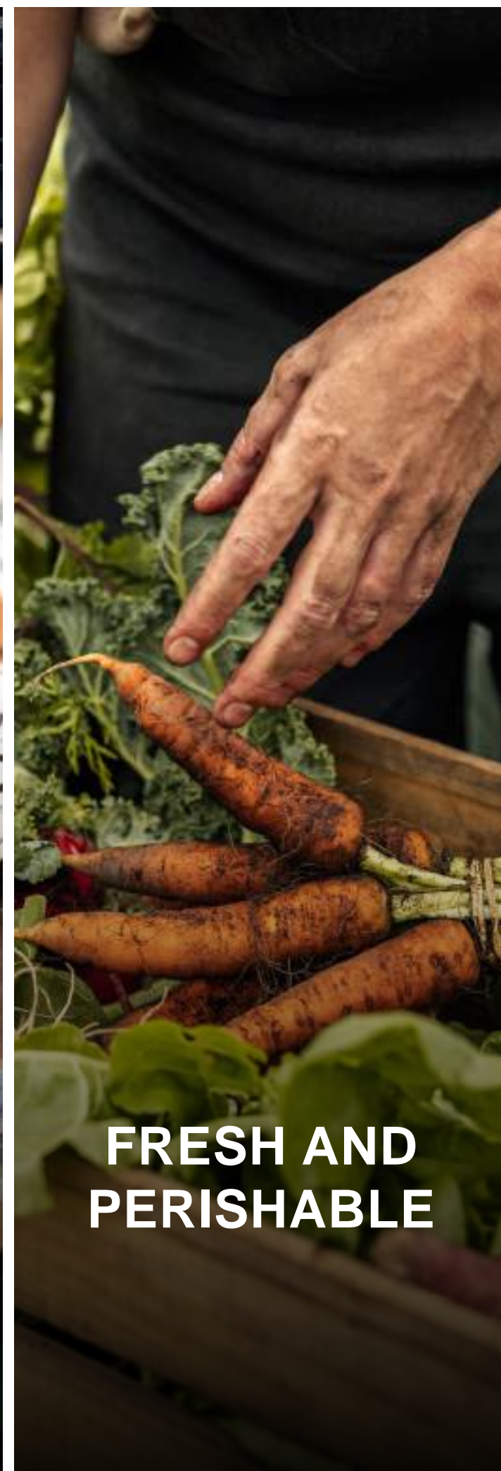
FRESH AND PERISHABLE