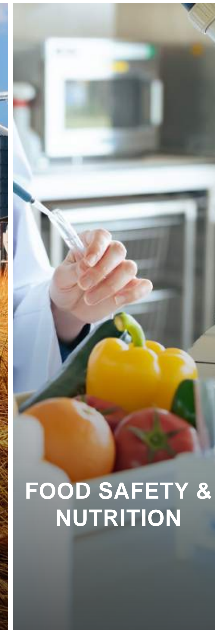
FOOD SAFETY & NUTRITION