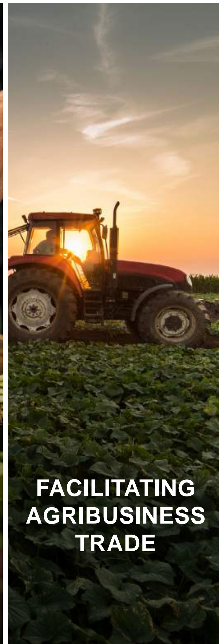
FACILITATING AGRIBUSINESS TRADE