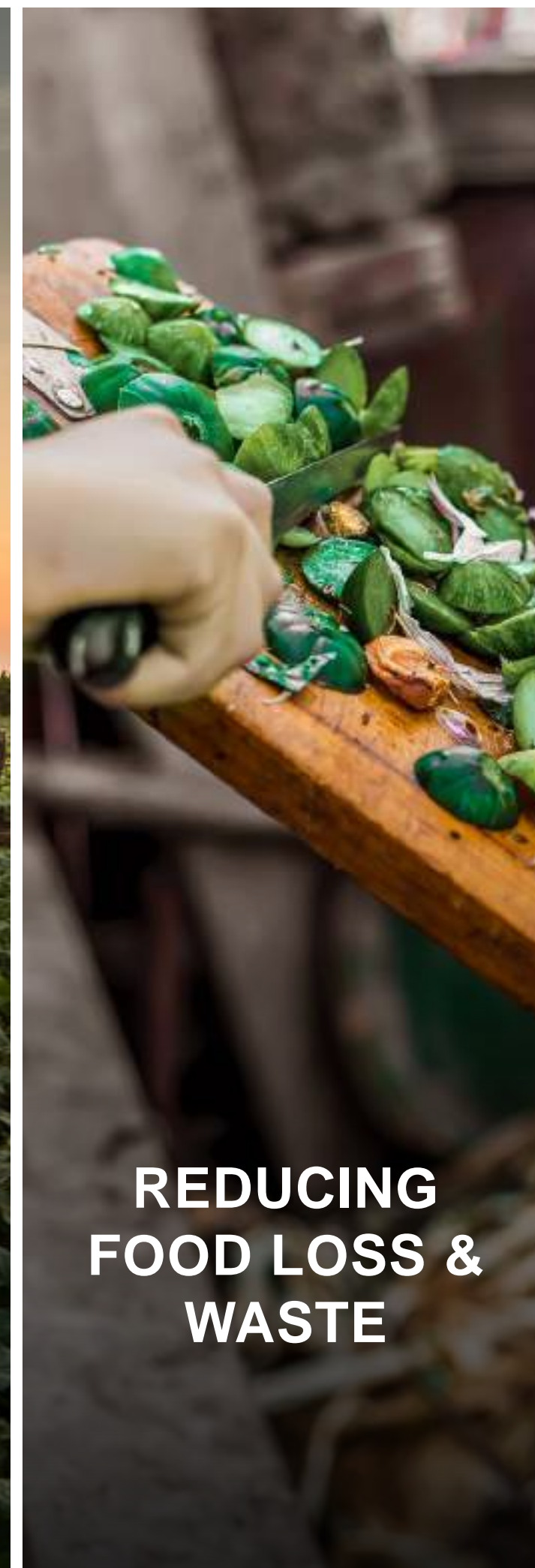
REDUCING FOOD LOSS & WASTE