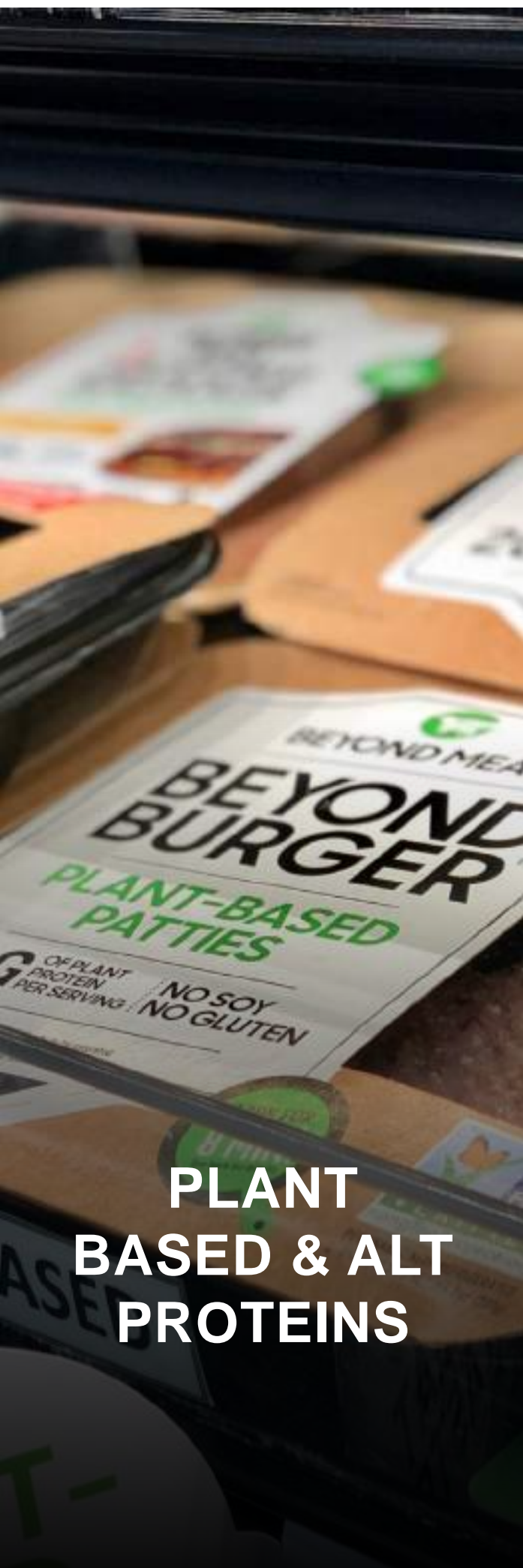
PLANT BASED & ALT PROTEINS