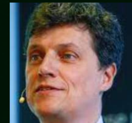
ANTOINE DE SAINT AFFRIQUE

Minister for Sustainability and the Environment SINGAPORE