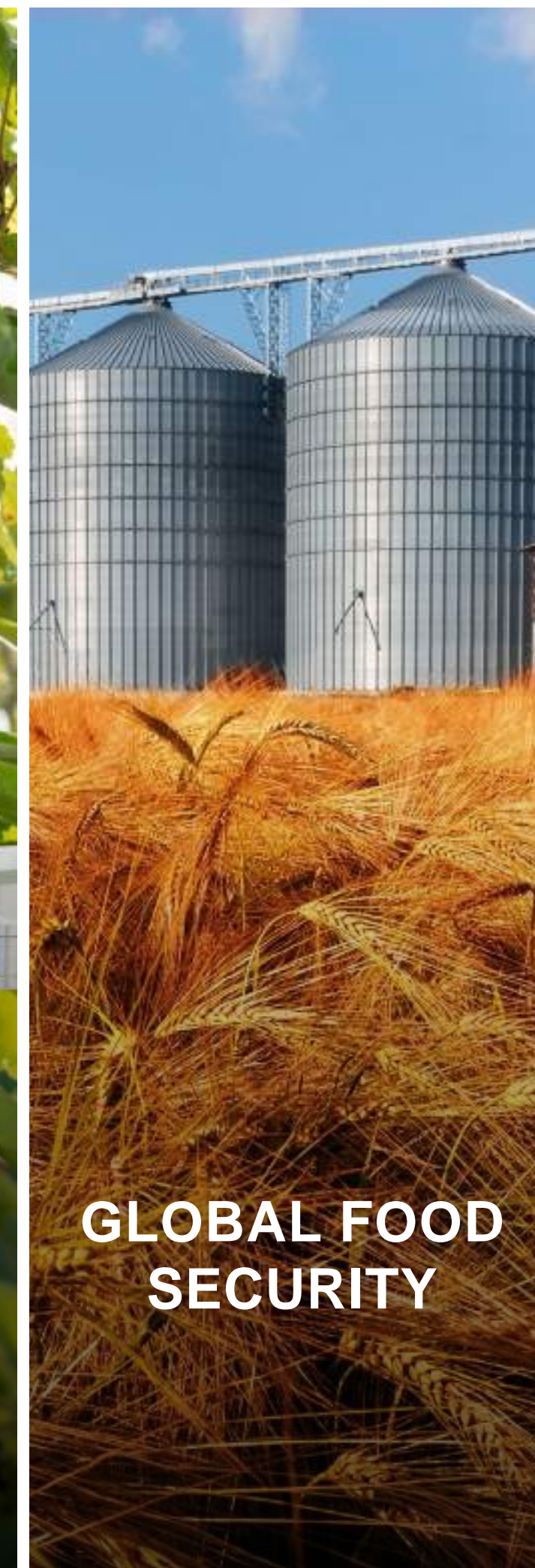
GLOBAL FOOD SECURITY