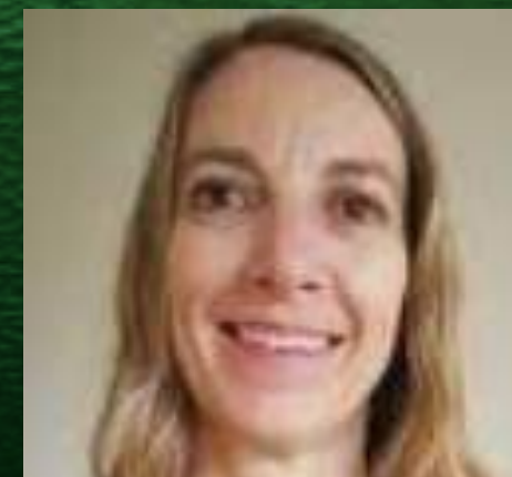
MARYLAURE CRETTAZ CORREDOR

African Union Special Envoy for Food Systems