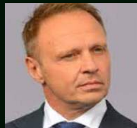
FRANCESCO LOLLOBRIGIDA Minister of Agriculture, Food Sovereignty and Forestry ITALY