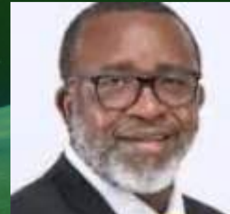
THE HON. MITHIKA LINTURI

Minister of Agriculture, Livestock, Fisheries and Co-operatives KENYA