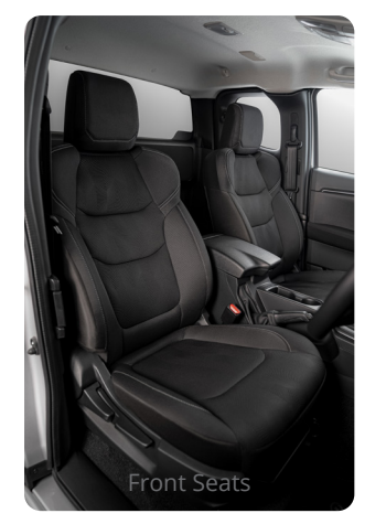
Manual 6-Way Adjustable Cloth Seat