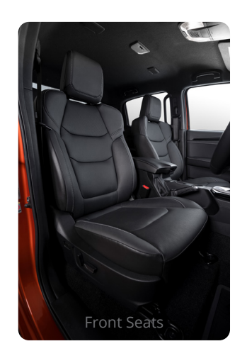
Power 8-Way Adjustable Partial Leather Seat with Power Lumbar Support