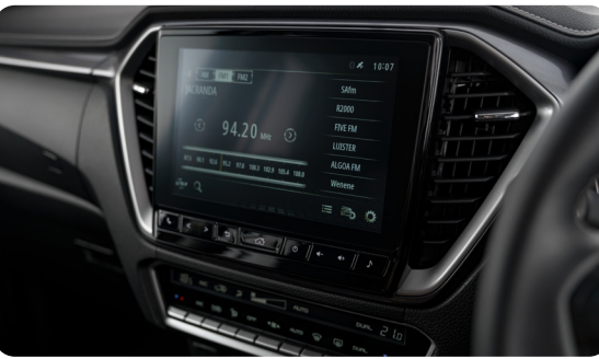
The display cluster is also linked to the infotainment system to reduce eye movement during driving and features second-row seatbelt reminders, allowing safety checks without the driver turning around.