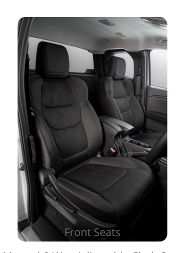
Manual 6-Way Adjustable Cloth Seat