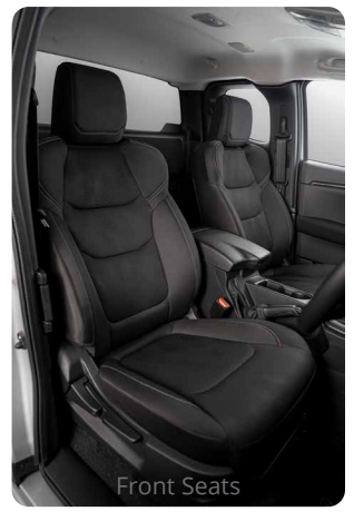
Manual 6-Way Adjustable Cloth Seat