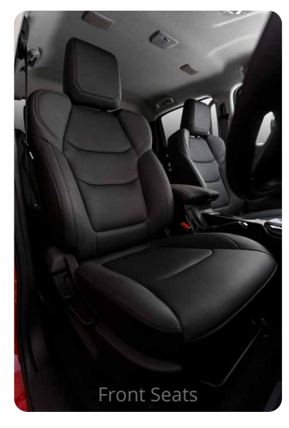
Manual 6-Way Adjustable Cloth Seat