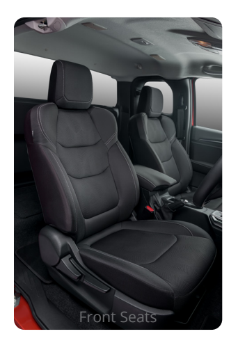
Manual 6-Way Adjustable Cloth Seat