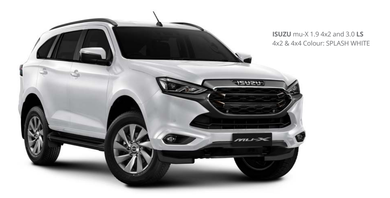
Available in the following colours: