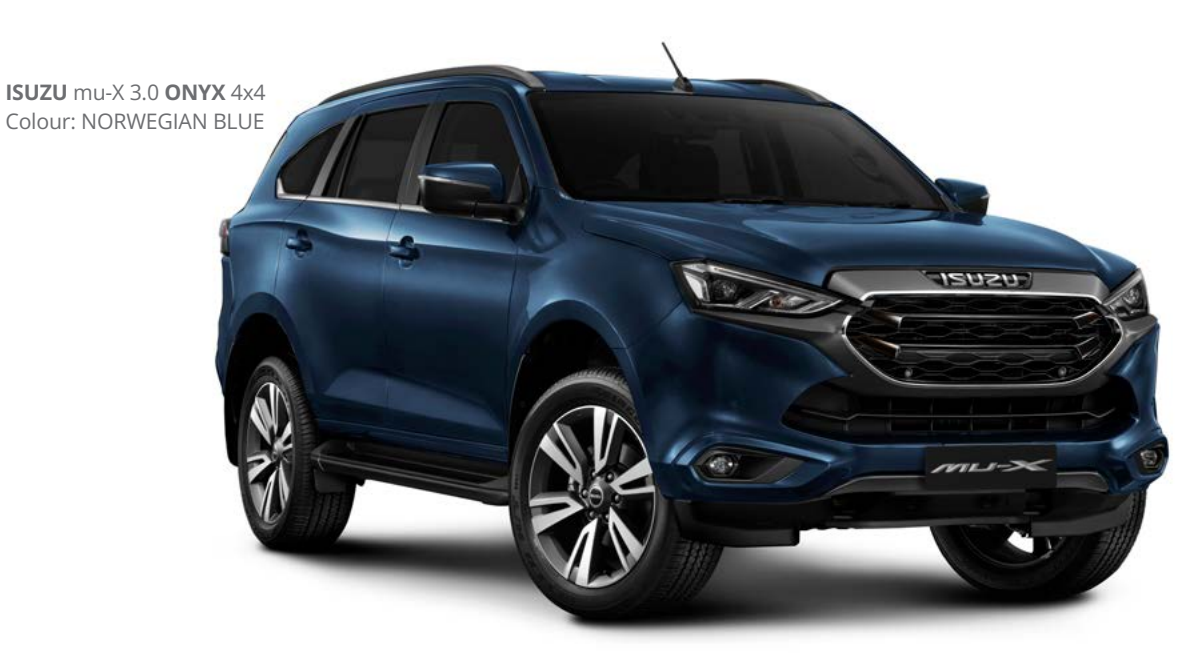
Available in the following colours: