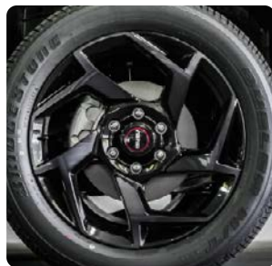
20" Alloy XT Styling