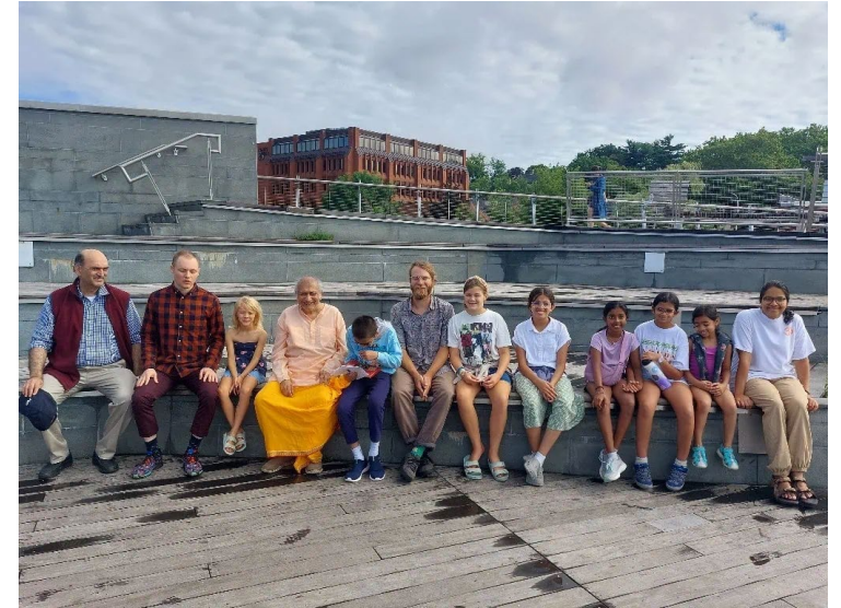
(2024) Camp Final Day Photo