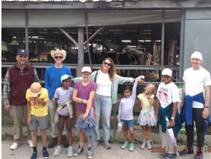
(2024) Wrights Dairy Farm and Bakery