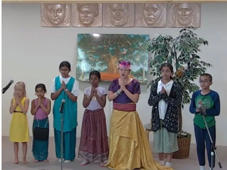
(2024) Showcase Chants