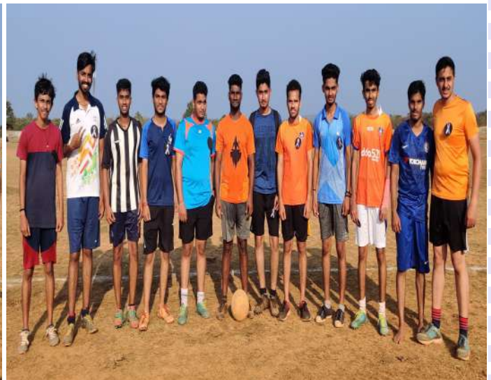
In-pic: (Left) The FACULTY team emerged as the winners for the exhibition football match. (Right) The STUDENTS team of IT department were runners up.