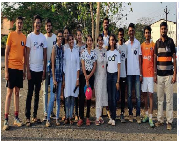
In-pic: The INTENSA Team