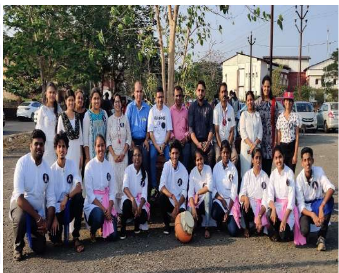
In-pic: The Street play team