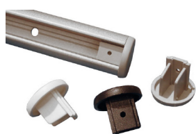
Track and caps

New! Mini Trac is now also available in a square shape.