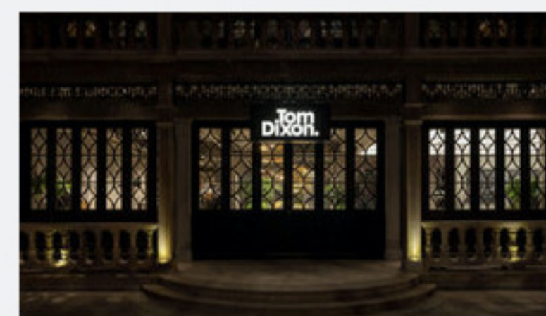
Tom Dixon Studio Opens New Shanghai Hub