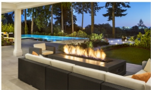
The Gables in Vancouver's Southlands. Ovation award-winning Renovation by Marino General Contracting Ltd.