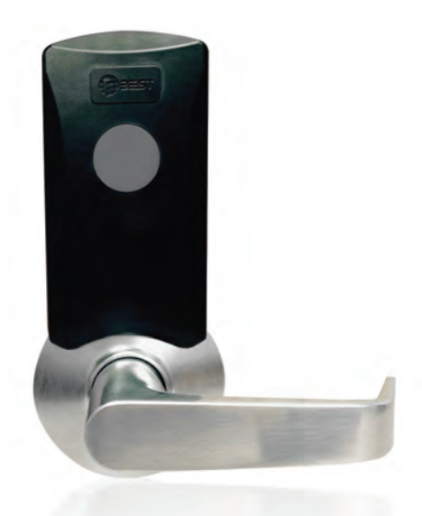
BEST SHELTERTM is a wireless responsive lockdown solution that can be configured to adapt to your building and security protocol. BEST offers a full suite of lockdown products for the commercial environment, ensuring all points of egress are protected

SHELTER—a unique combination of code-compliant mechanical hardware and proven technologies—is a responsive lockdown solution is ideal for all types of business environments and budgets. Even more, SHELTER was developed with input from those who have experienced live lockdown situations. This distinctive perspective lead to an innovative set of features and functionality that allows businesses to custom tailor how SHELTER responds immediately in the event of a lockdown.