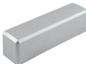
Beveled Plastic (P)