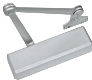
QDC111 Tri-Pack Arm