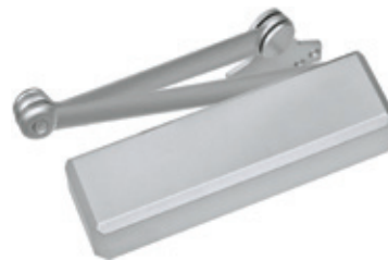
QDC115 Extra Duty Arm